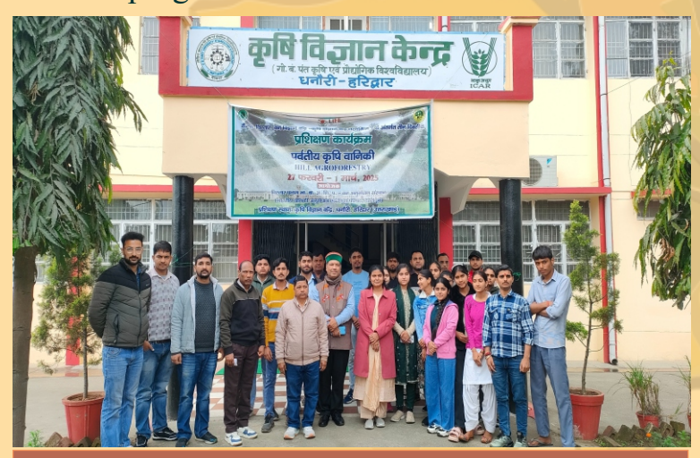
Training on "Hills Agroforestry" by ICFRE-FRI, Dehradun at KVK, Dhanouri, Haridwar

ICFRE-FRI, Dehradun organized training programme on "Hills Agroforestry" from 27<sup>th</sup> February 2025 to 01<sup>st</sup> March 2025 at KVK, Dhanouri, Haridwar. 28 participants including farmers and students from Haridwar participated in the programme.