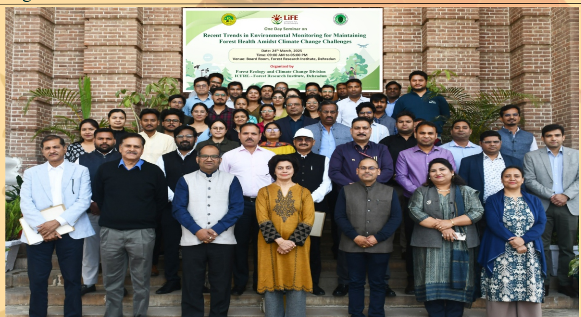
Seminar on "Recent Trends in Environmental Monitoring for Maintaining Forest Health Amidst Climate Change Challenges" by ICFRE-FRI, Dehradun

70 participants including Researchers, Scientists and Officers of ICFRE-FRI, Dehradun