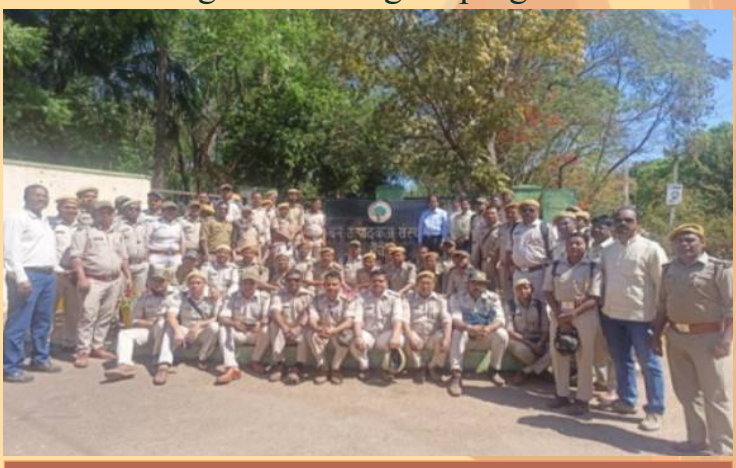
Educational Tour organized by ICFRE-IFP, Ranchi

Tour" for 80 Forest Guards from The Forester Training School, Chaibasa, Jharkhand on 06<sup>th</sup> March 2025. They were made aware about Tissue Culture, nurseries, Bamboosetum, medicinal garden during the programme.