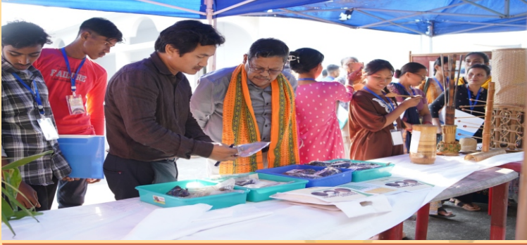
ICFRE-LEC, Agartala organized Tree Growers Mela at Gandhigram, Agartala

ICFRE-BRC, Aizawl, Mizoram organized Tree Growers Mela from 24th to 25th March 2025 at Aijol Club Park, Khatla, Aizawl.