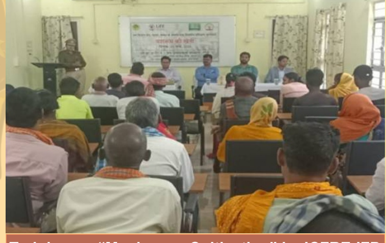
Training on "Mushroom Cultivation" by ICFRE-IFP, Ranchi at VVK, Banka, Bihar

ICFRE-IFP, Ranchi and Banka Forest Division, Bihar jointly organized training programme on "Mushroom Cultivation" on 05<sup>th</sup> March 2025 at VVK, Banka, Bihar. More than 50 participants including farmers and forest officers from Banka, Bihar participated in the programme.