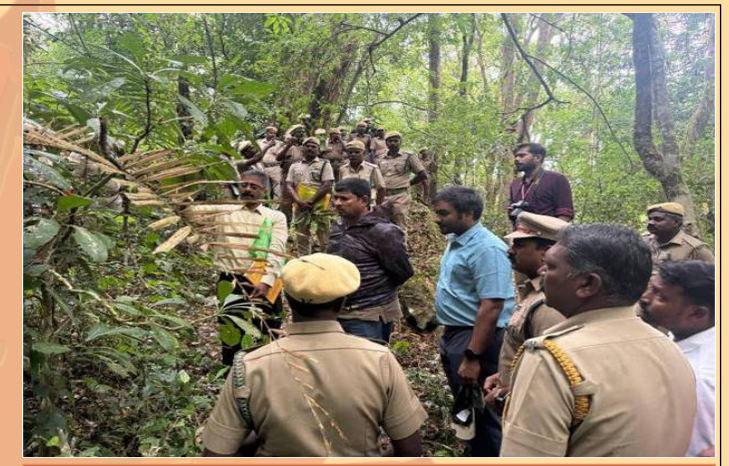
Training on "Three prioritized wild plant species for recovery plans" by ICFRE-IFGTB, Coimbatore