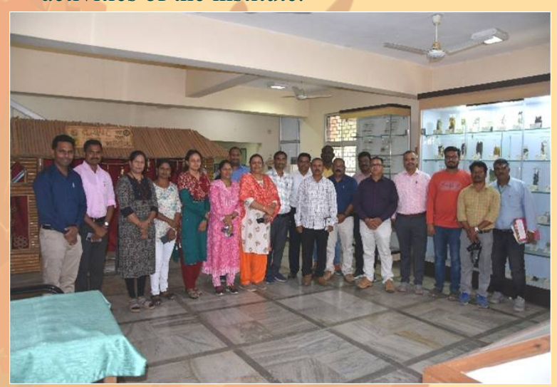
DFO,RFO,ACF from Maharastra Forest Department visited ICFRE-TFRI, Jabalpur

• 18 participants including DFO, RFO, ACF from Maharastra Forest Department visited ICFRE-TFRI, Jabalpur on 18<sup>th</sup> March 2025. They were briefed about various research activities of the institute.