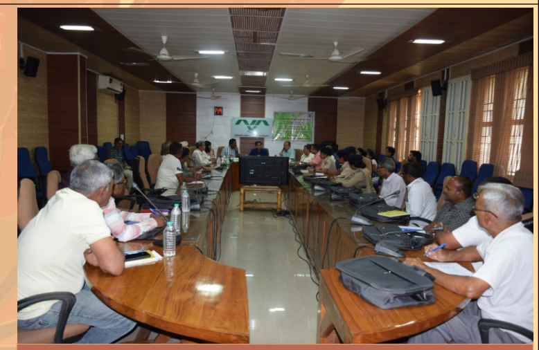
Training on "Quality Plant Material and Agroforestry" by ICFRE-AFRI, Jodhpur