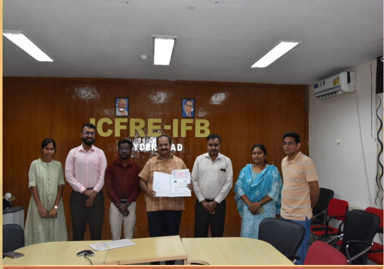
MoU signed between ICFRE-IFB, Hyderabad and School of Agriculture, SR University, Warangal, Telangana

• ICFRE-IFB, Hyderabad signed MoU with School of Agriculture, SR University, Warangal, Telangana on 04<sup>th</sup> March 2025 for accelerate the programme of various discipline of forestry and agroforestry research, education, training and extensions.