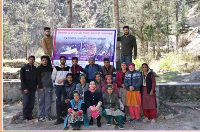
Training on "Need of Conservation and Sustainable Management of Chilgoza" by ICFRE-HFRI, Shimla

Management of Shisham in Nurseries 11. and Plantations