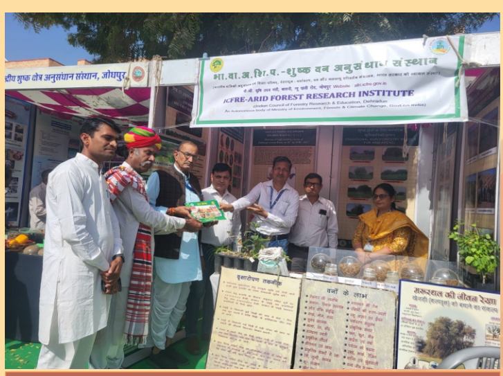
ICFRE-AFRI, Jodhpur organized Kisan Mela at Agricultural University, Jodhpur