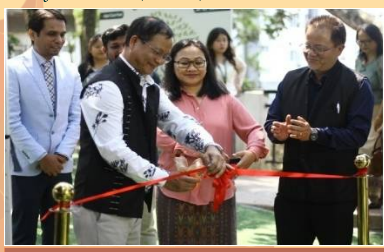
ICFRE-BRC, Aizawl organized Tree Growers Mela at Aijol Club Park, Khatla, Aizawl

ICFRE-BRC, Aizawl, Mizoram organized Tree Growers Mela from 24th to 25th March 2025 at Aijol Club Park, Khatla, Aizawl.