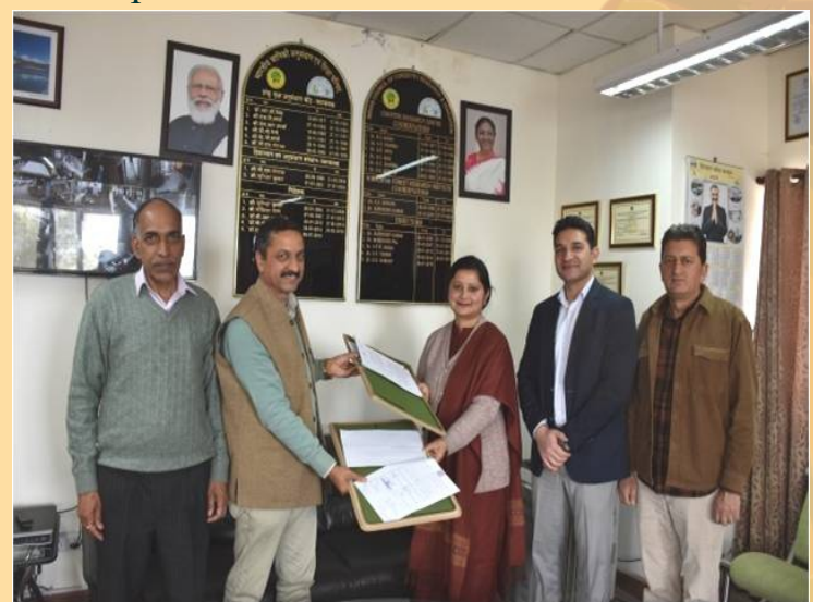
MoU signed between ICFRE-HFRI, Shimla and Wildlife Wing of the Himachal Pradesh Forest Department

• ICFRE-HFRI, Shimla signed MoU with Wildlife Wing of the Himachal Pradesh Forest Department on 12<sup>th</sup> March 2025 for Establishment of the western Himalayan Temperate Arboretum.