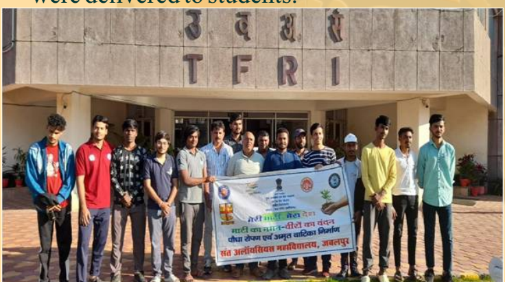
Students from St. Aloysius College, Jabalpur visited ICFRE-TFRI, Jabalpur

• 74 students along with faculties from Govt. College, Harrai, Chhindwara, St. Aloysius College, Jabalpur and Rajmata Scindia Govt. Girls College, Chhindwara visited ICFRE-TFRI, Jabalpur on 05<sup>th</sup>, 11<sup>th</sup> & 12<sup>th</sup> March 2025. Lecture on "Jiva amrut and Organic Farming were delivered to students.