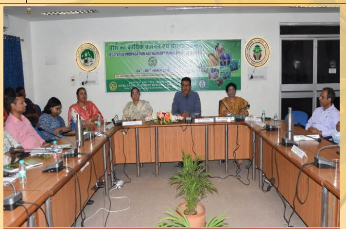
Training on "Vegetative propagation and Nursery management of Bamboo" by ICFRE-TFRI, Jabalpur