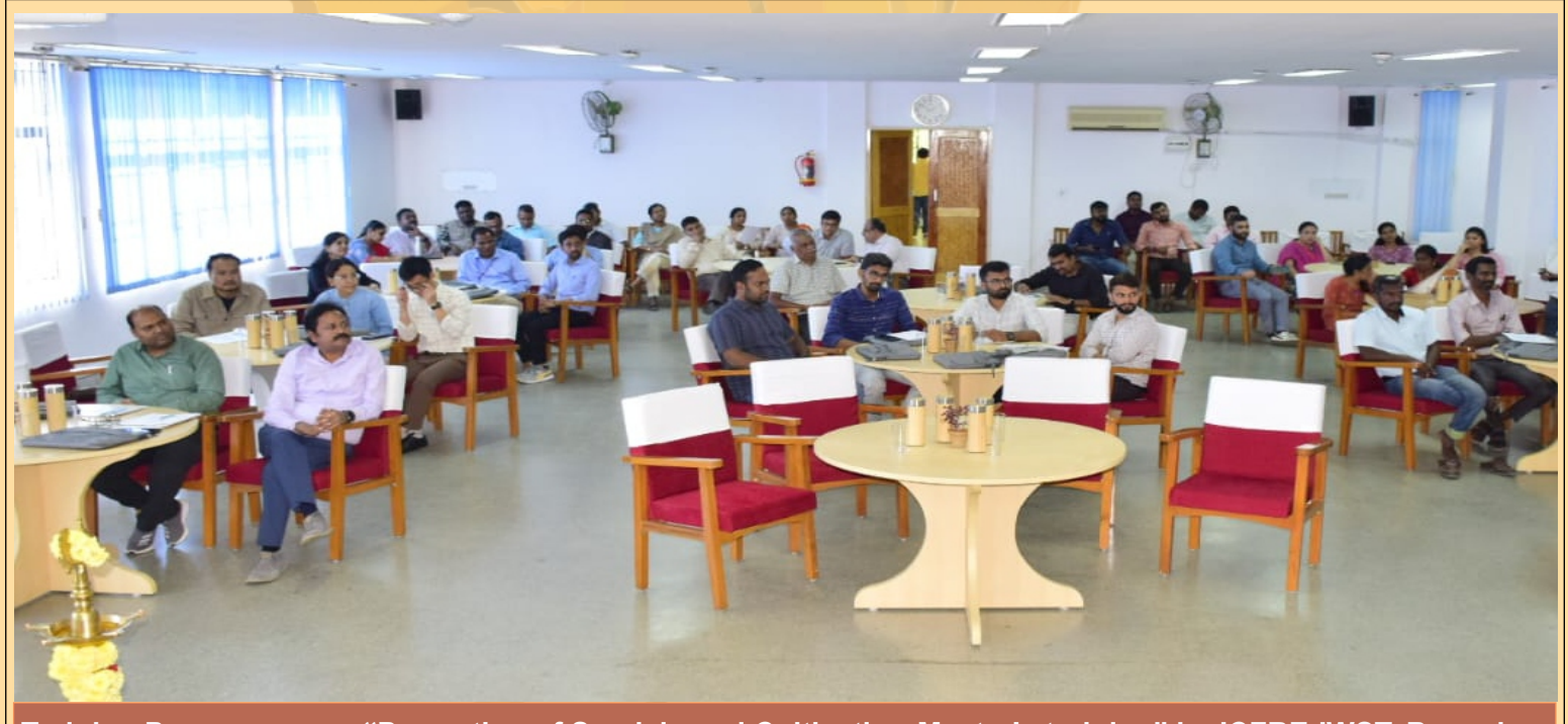
Training Programme on "Promotion of Sandalwood Cultivation-Master's training" by ICFRE-IWST, Bengaluru

25 participants including scientists, Researcher and technical staff from ICFRE institutes