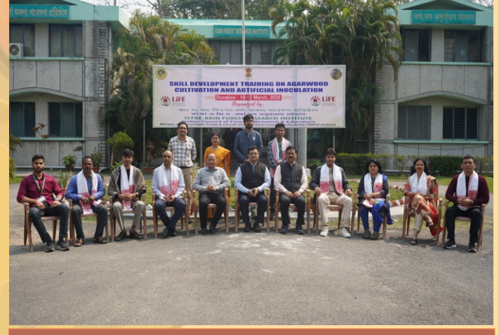
Training on "Agarwood Cultivation and Artificial Inoculation" by ICFRE-RFRI, Jorhat

Low Cost Vermicomposting techniques 24. for Livelihood generation