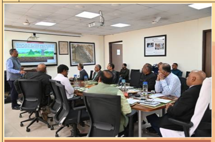
Training on "Forest soil health cards of Union Territory of Jammu and Kashmir" by ICFRE-HFRI, Shimla

24th March 40 farmers from Ramni panchayat, Himachal Pradesh