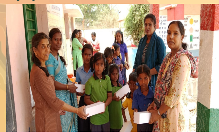
Awareness Programme on "Women and Girls: Right Equality and Empowerment" by ICFRE-IWST, Bengaluru

• ICFRE-IWST, Bengaluru organized awareness programme on "Women and Girls: Right Equality and Empowerment" on 19<sup>th</sup> March 2025 at Demo Village, Attivatta, Hosakote Taluk, Bengaluru. 40 students from village Attivatta, Bengaluru participated in the programme.