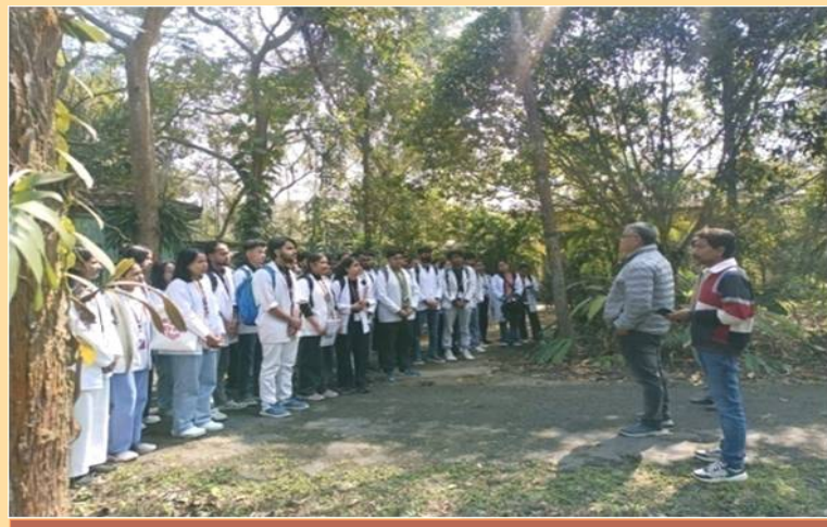
Students from Kaziranga University, Jorhat visited ICFRE-RFRI, Jorhat

A group of 30 Bamboo artisans from Titabar, Jorhat visited Bambusetum, Bamboo Nursery, Bamboo Composite Centre, Bamboo Charcoal and Bamboo Preservation Unit of ICFRE-RFRI, Jorhat on 04<sup>th</sup> March 2025.