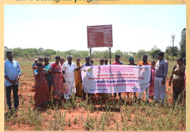
Training on "Farm Forestry" by ICFRE-IFGTB, Coimbatore at KVK, Vamban

Training Programme on "Farm Forestry" organized under VVK-KVK Networking on 5<sup>th</sup> March 2025 under KVK, Vamban. 90 farmers from Vamban and Pudukkottai participated in the programme and also organized plantation drive during the programme.