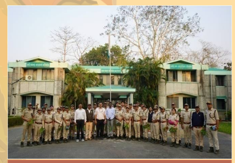
RFOs from Karnataka Forest Academy visited ICFRE-RFRI, Jorhat

• 41 RFO Trainee from Karnataka Forest Academy visited ICFRE-RFRI, Jorhat on 06<sup>th</sup> March 2025. They were made aware about the activities of the institute.