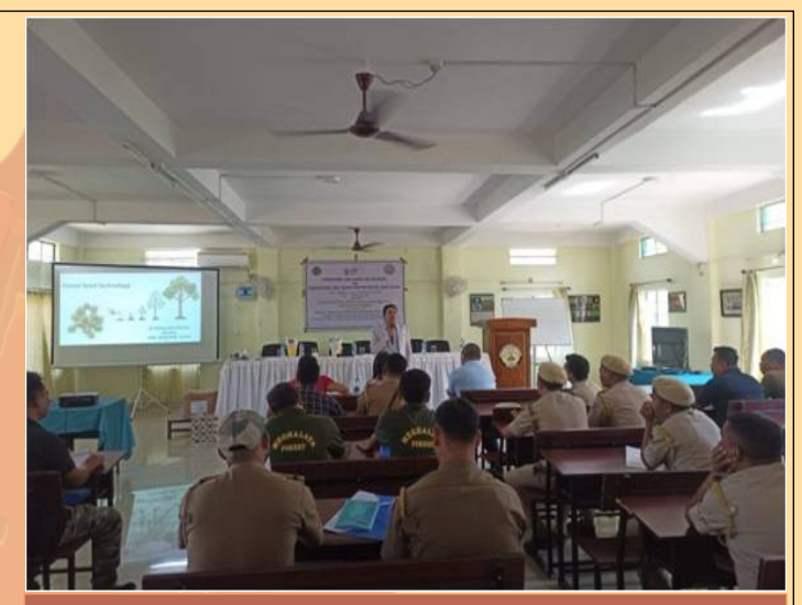
Training on "Composting Techniques and Forest Seed Technology" by ICFRE-RFRI, Jorhat

'Value addition of potential NTFP/ 26. LKFPs of Northeast India