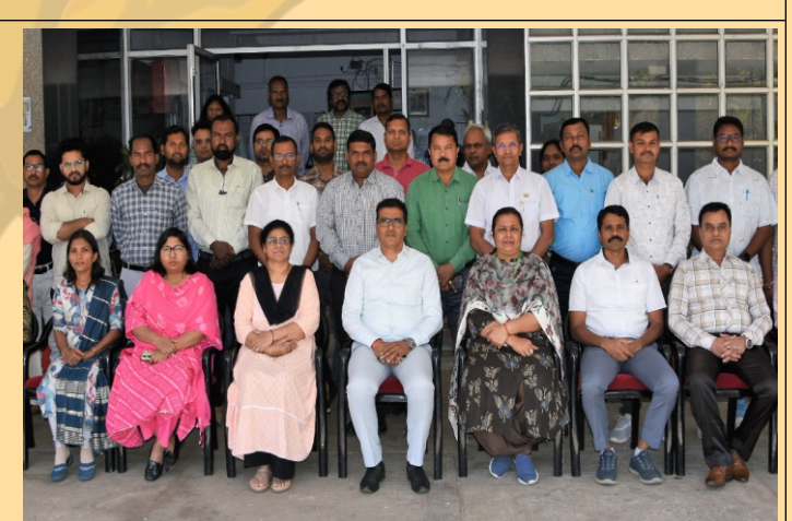
Training on "Agroforestry Management and Seed Technology of Bamboos" by ICFRE-TFRI, Jabalpur