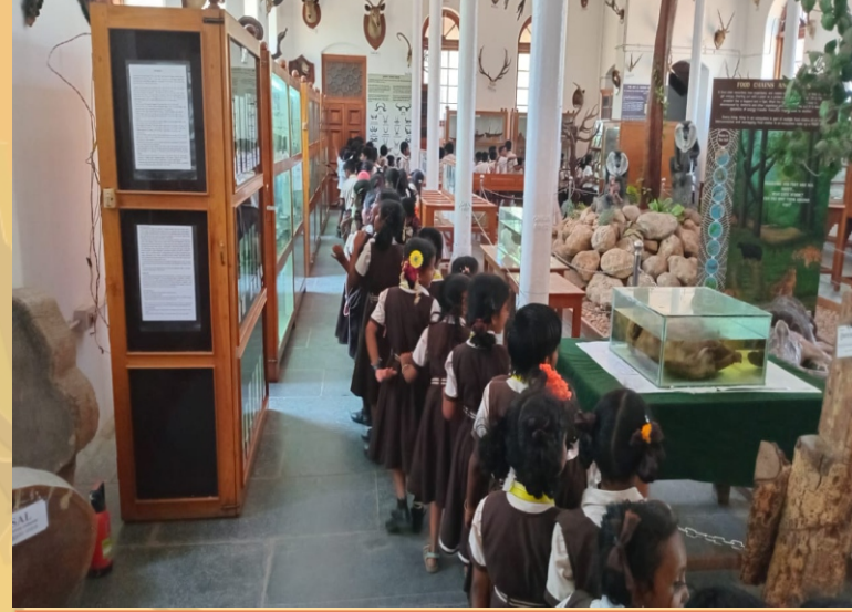
Students from Shri Vasavi Vidhyalaya Matric Higher Secondary School, Namakkal and Sri Sakthi Matriculation Higher Secondary School, Coimbatore visited ICFRE-IFGTB, Coimbatore