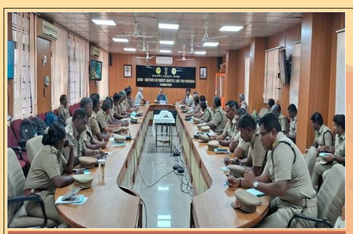
Training on "Agroforestry Models - Establishment and Management " by ICFRE-IFGTB, Coimbatore