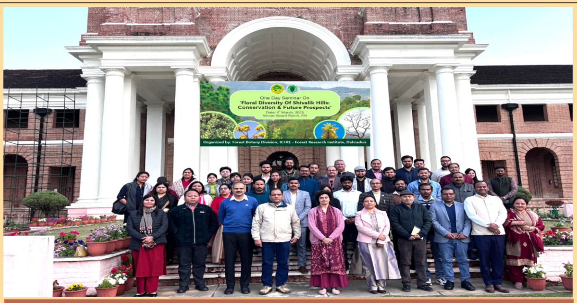
Seminar on "Floral Diversity of Shivalik Hills: Conservation & Future Prospects' by ICFRE-FRI, Dehradun

Recent Trends in Environmental Monitoring for Maintaining Forest Health Amidst Climate Change Challenges