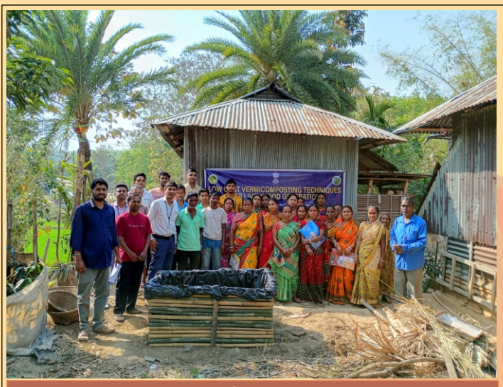
Training on "Low Cost Vermicomposting techniques for Livelihood generation" by ICFRE-RFRI, Jorhat