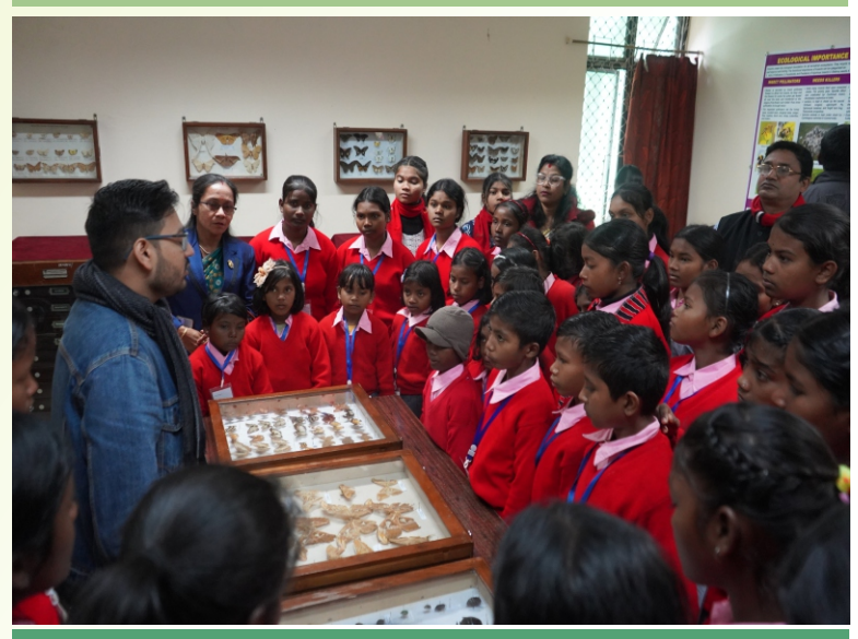
Students from Titabar Girls & Boys Residential Special Training Centre visited ICFRE-RFRI, Jorhat

544 students along with teachers from Teok Rajabari H.S. School, Jorhat, Teok Rajabari Nilamoni Phookan Girls High School, Jorhat, Sakai Khongia High School, Jorhat, Malow Khat Higher Secondary School, Jorhat, Titabar Girls' Residential Special Training Centre, Jorhat Boys' Residential Special Training Centre, Titaram Bordoloi High School, Dahotia Girls' High School, Dohotia H S School, Jorhat and SPV Girls School, Jorhat visited Bambusetum, Bamboo Nursery, Botanical Garden, Insectarium, Bamboo Composite Centre at ICFRE-RFRI, Jorhat on 10<sup>th</sup>, 11<sup>th</sup>, 12<sup>th</sup>, 13<sup>th</sup> & 14<sup>th</sup> February 2025.