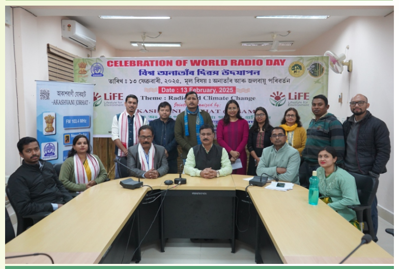
World Radio Day was celebrated by ICFRE-RFRI, Jorhat and Akashvani, Jorhat

ICFRE-RFRI, Jorhat and Akashvani, Jorhat jointly celebrated World Radio Day on 13<sup>th</sup> February 2025.