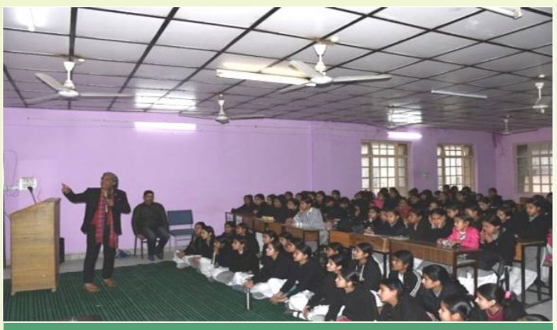
ICFRE-HFRI,Shimla organized "Educational Programme" at Girls Senior Secondary School, Mandi (HP)

150 students along with teachers participated in Educational Programme organized by ICFRE-HFRI, Shimla on 20<sup>th</sup> February 2025 at Girls Senior Secondary School, Mandi, Himachal Pradesh. They were briefed about Insecticide Pollution, Insect pests and Mitigation strategies during the programme.