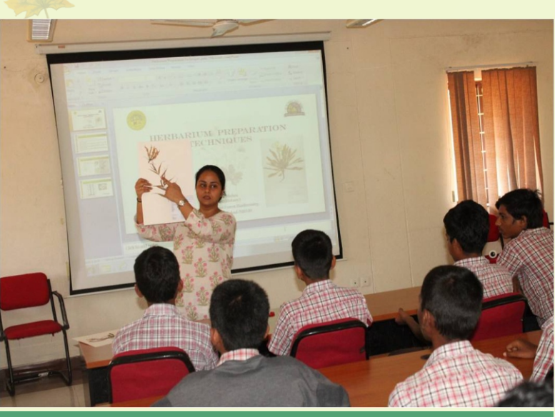
National Science Day was celebrated by ICFRE-IFB, Hyderabad