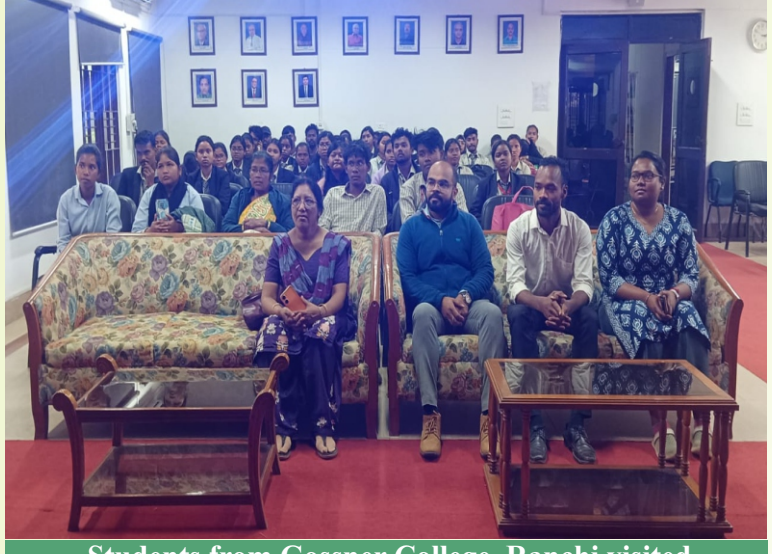
Students from Gossner College, Ranchi visited ICFRE-IFP, Ranchi

ICFRE-IFP, Ranchi organized Educational Tour programme for Gossner College, Ranchi on 03<sup>rd</sup> February 2025. 60 participants including students and faculties participated in the programme Lecture on ongoing research in Genetics and Tree Breeding delivered to students.