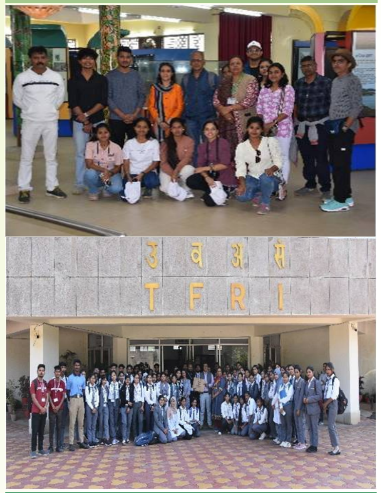
Students from MD College, Parel, Mumbai and Shri Ram College, Jabalpur visited ICFRE-TFRI, Jabalpur

216 students along with faculties from MD College, Parel, Mumbai, Shri Ram College, Jabalpur, Ajax Paramedical College, Neemkheda and PG College, Chhindwara visited ICFRE-TFRI, Jabalpur on 5<sup>th</sup>,6<sup>th</sup>, 7<sup>th</sup>,11<sup>th</sup>,13<sup>th</sup> & 17<sup>th</sup> February 2025. Lecture on Air Layering, Budding and Preparation of Soil Sand and FYM ratio delivered to students.