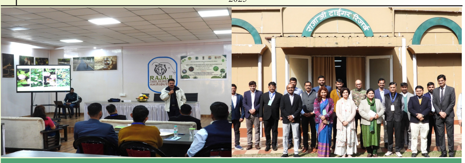
Training on "Best Practices for Effective Management of Invasive Alien Plants" by ICFRE-FRI, Dehradun

20 officers from Rajaji National Park, Chilla