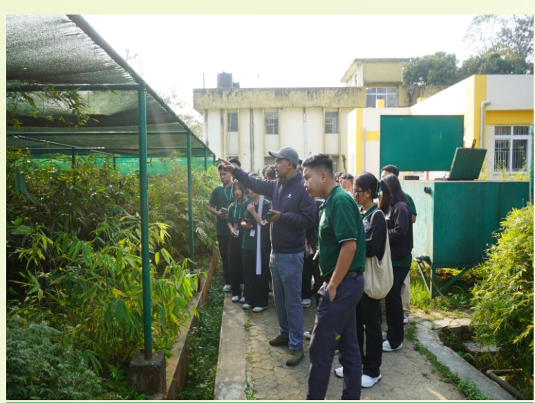
Visit of students from FGI, college of Agricultural Science, Hengbung, Manipur to ICFRE-RFRI, Jorhat

63 students from FGI, college of Agricultural Science, Hengbung, Manipur and Ayush Pharmacy Institute of Sri Sri Dakhinpat Satra, Saroi, Jorhat visited ICFRE-RFRI, Jorhat on 10<sup>th</sup> & 19<sup>th</sup> February 2025. They were briefed about various species of Bamboo and research & development activities of institute.