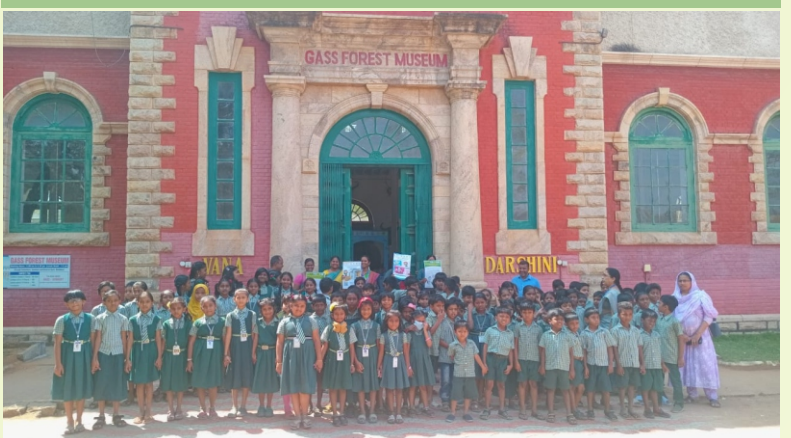
Students from Corporation Primary School, Ramalingam Calony, Coimbatore visited ICFRE-IFGTB Coimbatore

292 students along with teachers from M.S. Vidyalaya Matric Higher Secondary School and Corporation Primary School, Ramalingam Calony, Coimbatore visited Gass Forest Museum of ICFRE-IFGTB, Coimbatore on 21st February 2025. They were made aware about various research activities of the institute.