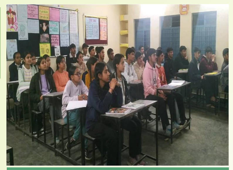
Awareness programme on "Application of Bio-Fertilizers and Biopesticides" by ICFRE-HFRI, Shimla