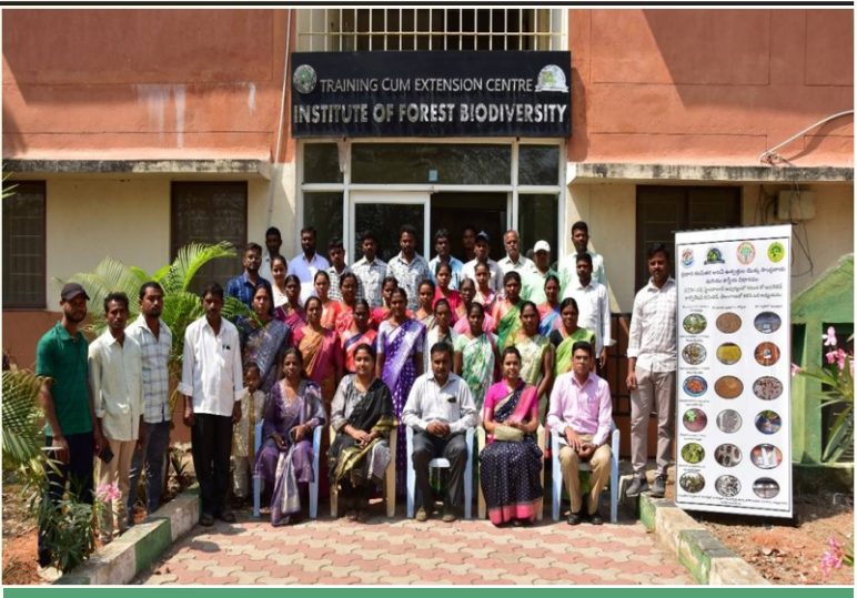
Training on "Scientific Harvesting and processing of NTFPs" by ICFRE-IFB, Hyderabad

Training on "Plant Volatiles in Insect Pest Management" by ICFRE-IFB, Hyderabad