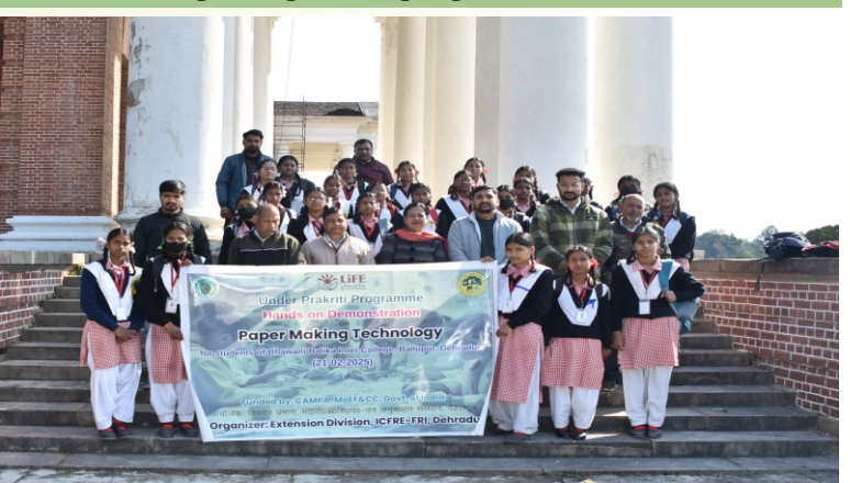
ICFRE- FRI organized "Paper Making Technology Programme" at ICFRE-FRI, Dehradun

ICFRE-FRI, Dehradun organized "Paper Making Technology programme on 21<sup>st</sup> February 2025. 21 students from Bhawani Balika Inter College, Ballupur, Dehradun participated in programme.