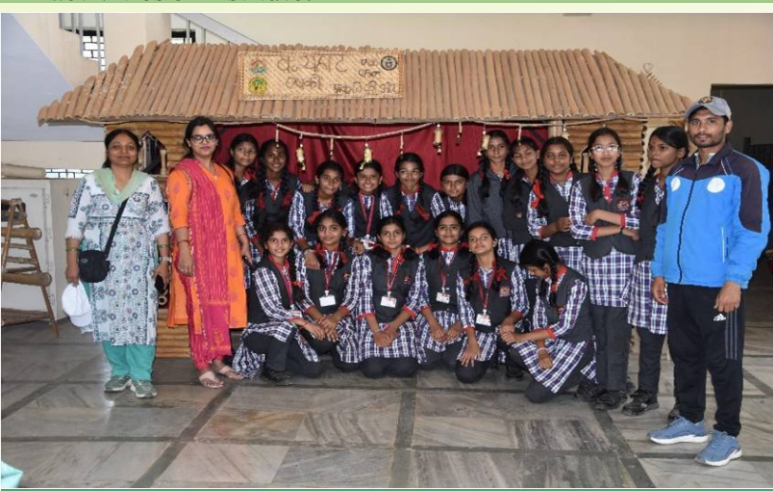
Students from Kendriya Vidyalaya, Jabalpur visited ICFRE-TFRI, Jabalpur

84 students along with teachers from Kendriya Vidyalaya, Jabalpur visited ICFRE-TFRI, Jabalpur on 11<sup>th</sup> February 2025. They were briefed about various activities of institute.