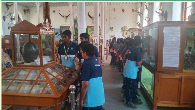
Students from M.S. Vidyalaya Matric Higher Secondary School, Coimbatore visited ICFRE-IFGTB, Coimbatore