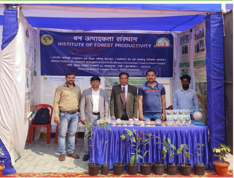
Stall by ICFRE-IFP, Ranchi in "Co-Operative Convention-Cum-Exhibition and inauguration of C-PARC (JHAMFCOFED)" at JHAMFCOFED, Ranchi, Jharkhand

ICFRE-IFP, Ranchi participated and showcasing its exhibition in "Co-Operative Convention-Cum-Exhibition and inauguration of C-PARC (JHAMFCOFED)" organized by JHAMFCOFED, Ranchi, Jharkhand on 22<sup>nd</sup> February 2025 and showcased various activities of institute.