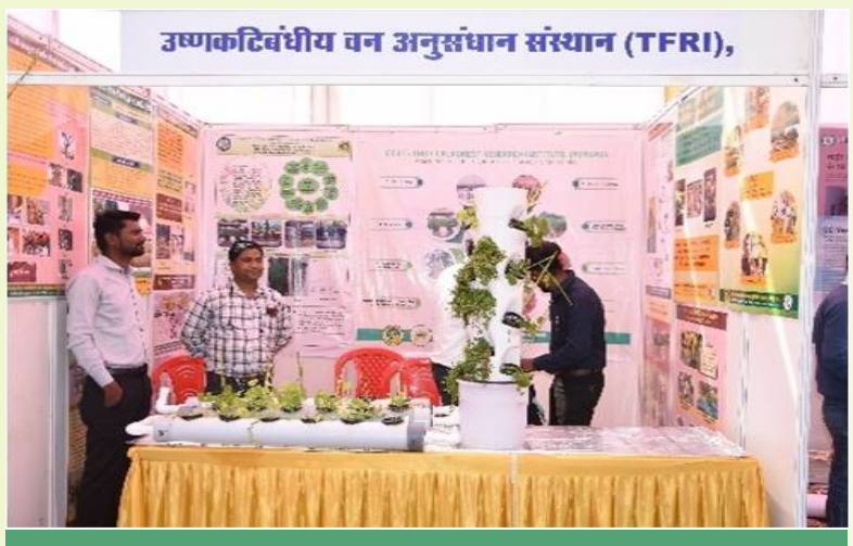
Stall by ICFRE-TFRI, Jabalpur in "Kisan Mela-2025" at ICAR- Directorate of Weed Research, Jabalpur

ICFRE-TFRI, Jabalpur participated and showcasing its exhibition in "Kisan Mela 2025" organized by ICAR-Directorate of Weed Research, Jabalpur on 18<sup>th</sup> February 2025.