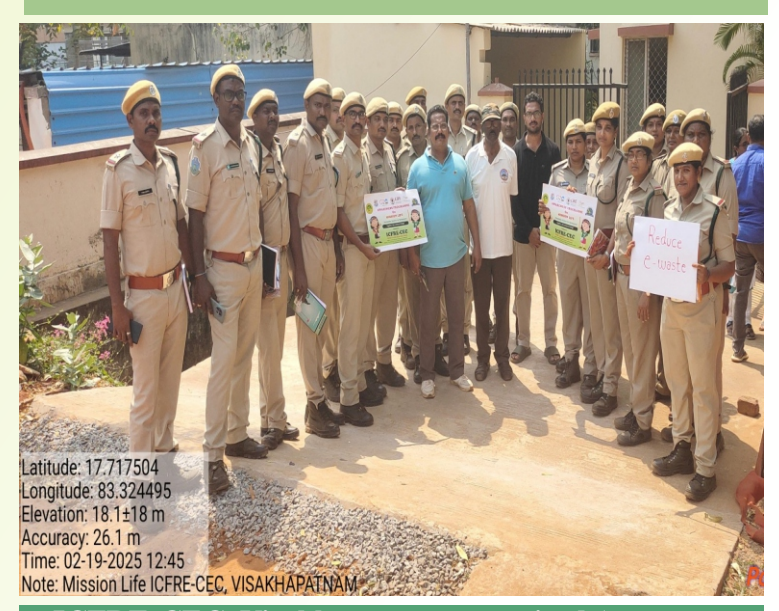
ICFRE-CEC, Visakhapatnam organized Awareness Programme at Andhra Pradesh State Forest Academy, Rajamahendravaram

ICFRE-CEC, Visakhapatnam organized Awareness Programme on 19<sup>th</sup> February 2025 on the topic Reducing e-waste and Adopting Healthy lifestyles. 57 Forest Section Officers and Forest Beat Officers from Andhra Pradesh State Forest Academy, Rajamahendravaram participated in the programme.