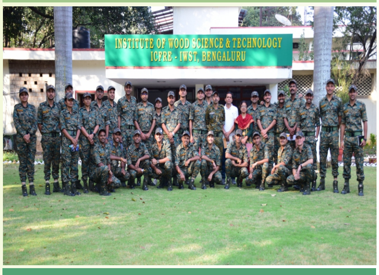
RFO from Uttarakhand Forestry Training Academy, Haldwani, Nanital visited ICFRE-IWST, Bengaluru

38 RFO trainees from Uttarakhand Forestry Training Academy, Haldwani, Nanital visited ICFRE-IWST, Bengaluru on 05<sup>th</sup> February 2025.