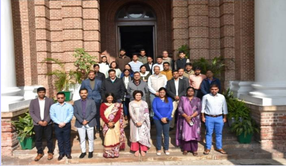
Training programme on “Forest Fire Monitoring and Damage Assessment” by ICFRE-FRI, Dehradun