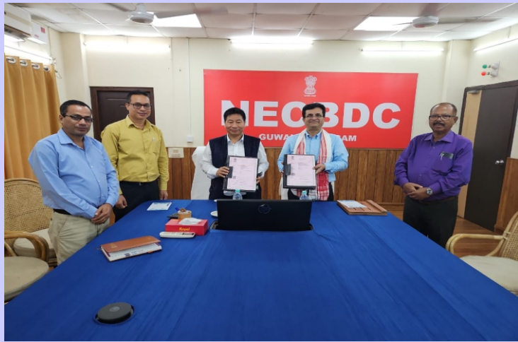
MoU signed between ICFRE-RFRI, Jorhat and North East Cane and Bamboo Development Council, Guwahati