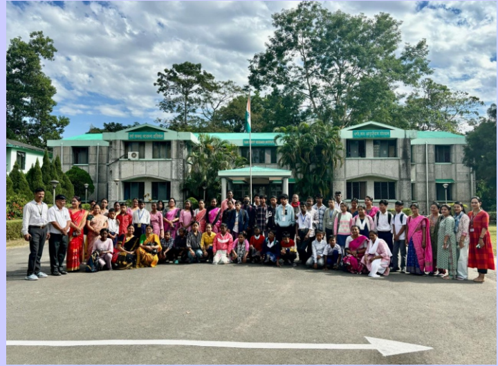
Visit of students from CWSN of different schools of Jorhat visited ICFRE-RFRI, Jorhat