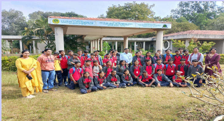
Visit of students from Kendriya Vidyalaya Sangathan, Galconda, Hyderabad, Telangana visited ICFRE-IFB, Hyderabad