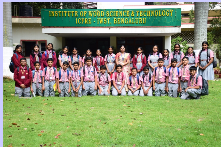
Visit of students from Bunts Sangha RNS Vidhyaniketan, Magadi Road, Bengaluru visited ICFRE-IWST, Bengaluru