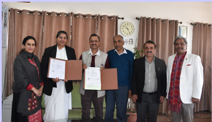
MoU signed between ICFRE-HFRI, Shimla and St. Bede's College, Shimla