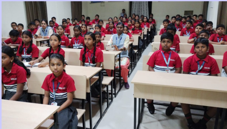
Visit of students from Vidhya Vikasini Amritha Vidhyalayam School, Coimbatore visited ICFRE-IFGTB, Coimbatore