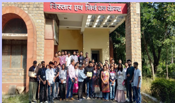
Visit of students from FRI (DU), Dehradun visited ICFRE-AFRI, Jodhpur