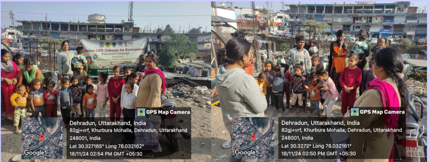
Awareness programme on “Lifestyle for Environment” by ICFRE-FRI, Dehradun