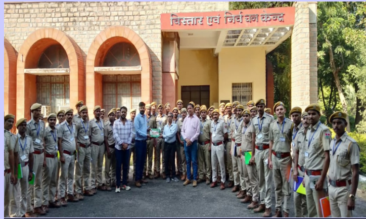
48 Forest Guards from FSTC, FTI, Jodhpur, visited ICFRE-AFRI, Jodhpur