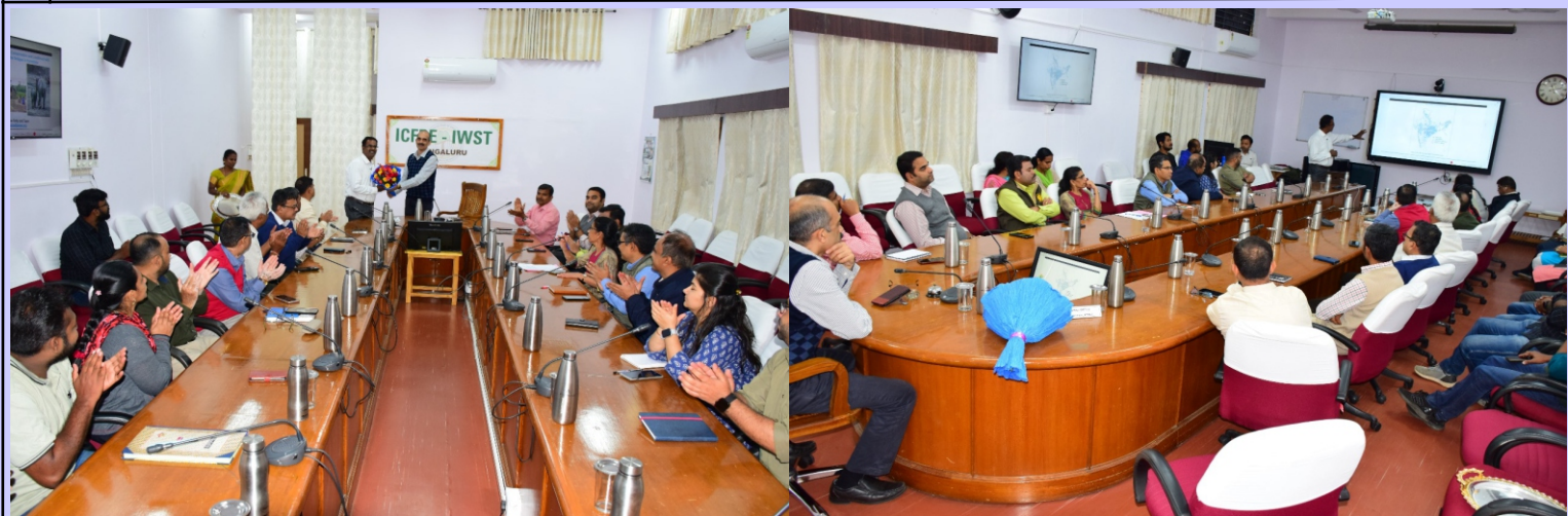
Workshop on “Biodiversity Conservation and Livelihood with special reference to Soligas in Karnataka” by ICFRE-IWST, Bengaluru