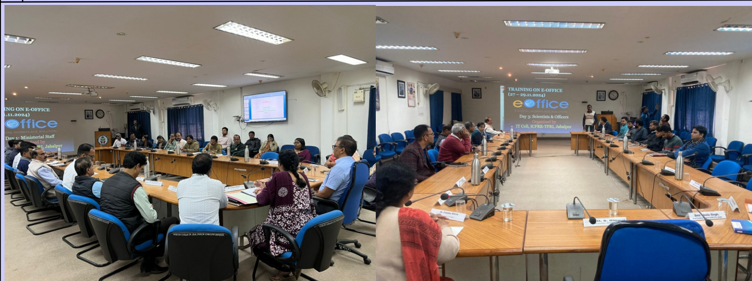
Training programme on “E-Office” by ICFRE-TFRI, Jabalpur