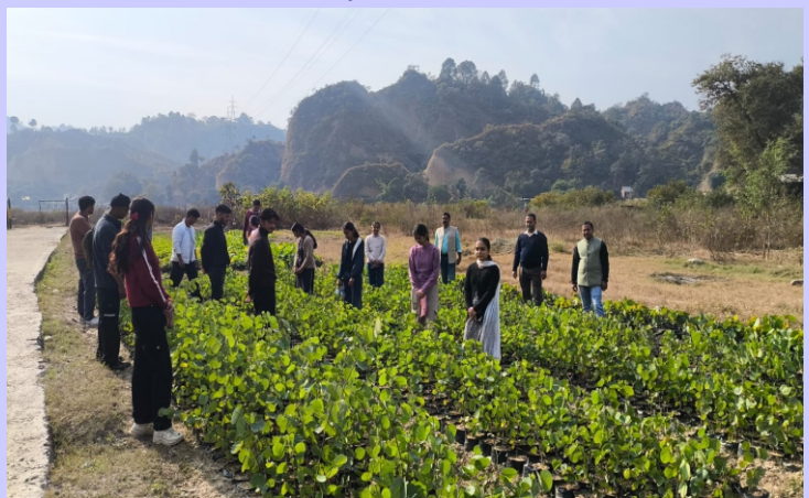
Visit of students from Govt. PG College, Dharampur, Mandi to Shivdwala Nursery, VVK, Dharampur