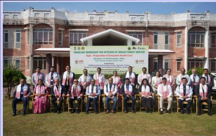
Training programme on “Preparation of Ecosystem Health Card” by ICFRE-RFRI, Jorhat