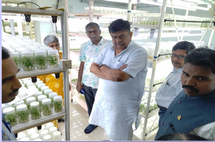
Shri Sanjay Sharma, Hon'ble minister of Environment Forest and Climate Change & Science and Technology Govt. of Rajasthan visited ICFRE-IFGTB, Coimbatore

Seed Storage facility and Gass Museum of ICFRE-IFGTB, Coimbatore on 27 th November 2024. He also reviewed research and development activities of institute.