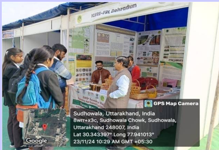
Stall by ICFRE-FRI, Dehradun in “5 th Dehradun International Science and Technology Festival-2024” at Uttarakhand Technical University, Dehradun