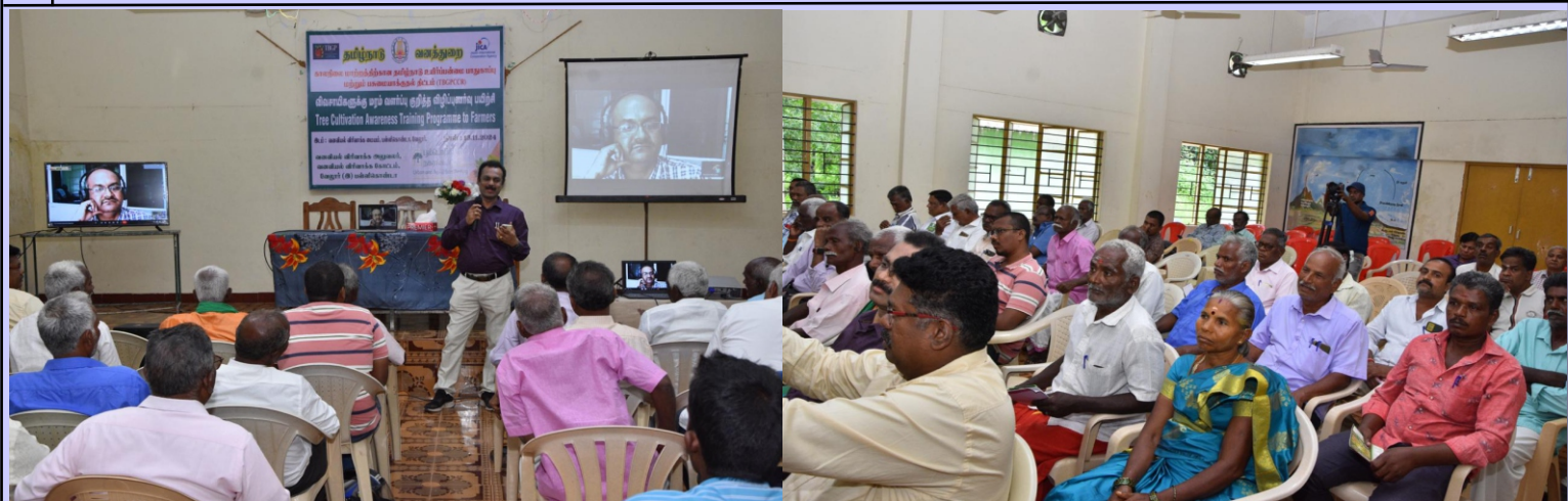
Workshop on “Tree Cultivation Awareness Programme” by ICFRE-IFGTB, Coimbatore