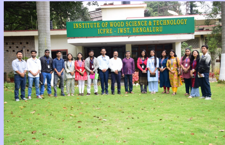
Visit of students from Cotton University, Guwahati visited ICFRE-IWST, Bengaluru