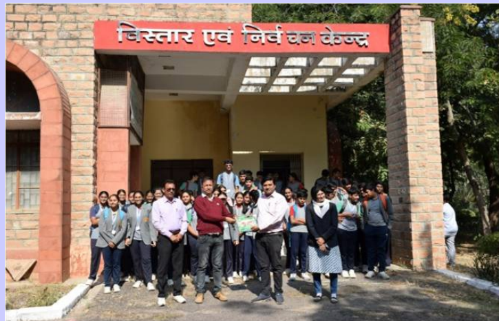
Visit of students from Shri Aurobindo School, Jodhpur visited ICFRE-AFRI, Jodhpur