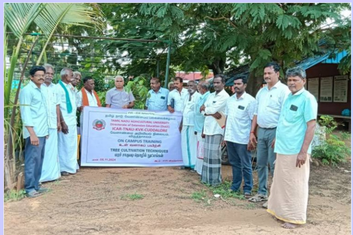
Training programme on “Tree Cultivation Techniques” by ICFRE-IFGTB, Coimbatore