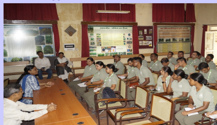
40 SFS Officers from CASFOS, Dehradun visited ICFRE-AFRI, Jodhpur