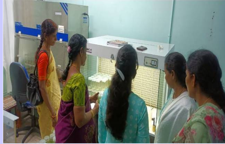
5 officers from BIOTRIM, Andhra Pradesh Forest Department visited from ICFRE-IFGTB, Coimbatore