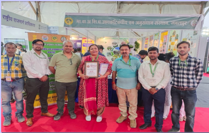
Stall by ICFRE-TFRI, Jabalpur in “First Mahakoshal Vigyan Mela” at Veterinary University, Jabalpur