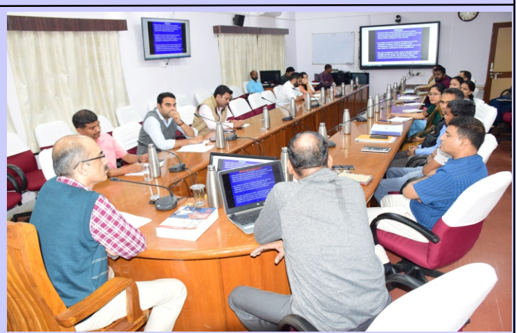
Training programme on “HS code of wood and wood products covering classification and duty structure” by ICFRE-IWST, Bengaluru