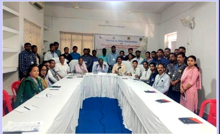
Training programme on “Forestry in Addressing Livelihood issued on people of Northeastern” by ICFRE-RFRI, Jorhat