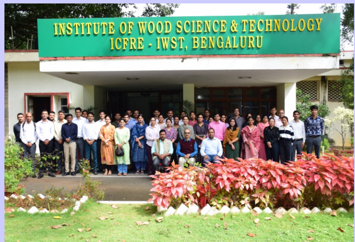
40 SFS Officers from CASFOS, Dehradun visited ICFRE-IWST, Bengaluru