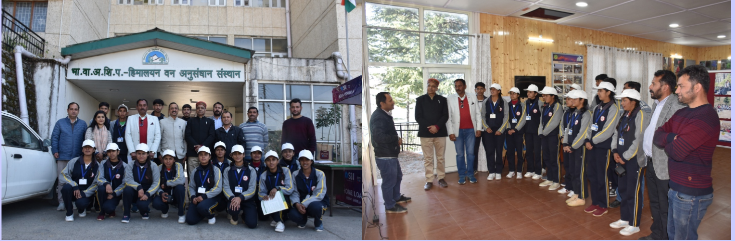
Visit of students from Govt. Senior Secondary School, Devgarh, Kotkhai, Shimla visited ICFRE-HFRI, Shimla