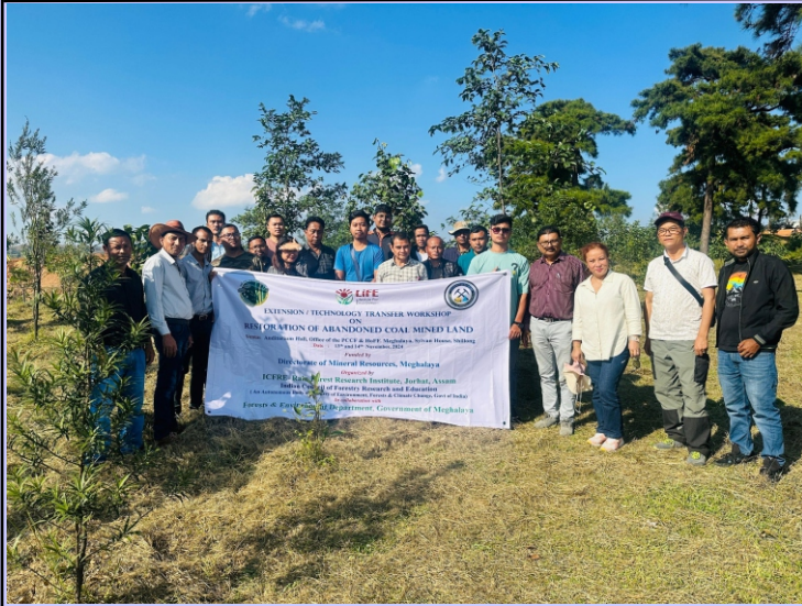
Workshop on “Restoration of coalmine land with microbial technology” by ICFRE-RFRI, Jorhat