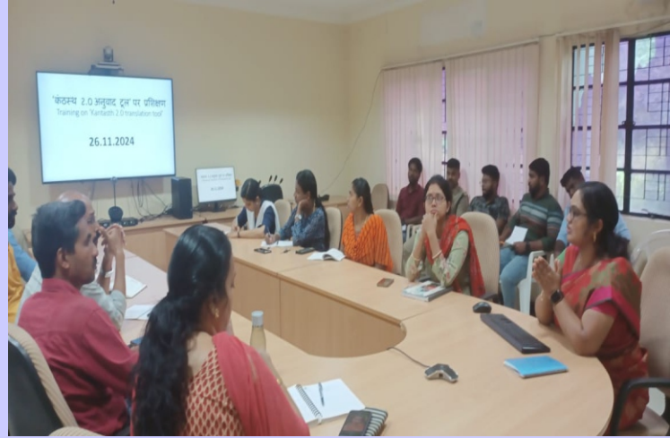
Training programme on “Kanthasth Translation Tool” by ICFRE-IFGTB, Coimbatore