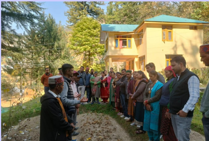
40 participants from SHG of JICA Forestry Project, Vanmandal visited VVK, Jagatsukh, Kullu