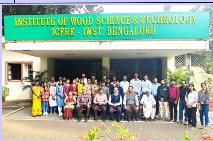
Training programme on “Sandalwood Cultivation and its Prospects” by ICFRE-IWST, Bengaluru