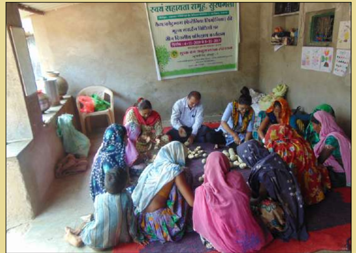
Training-cum-demonstration programmes in Jamboori and Surpagla villages