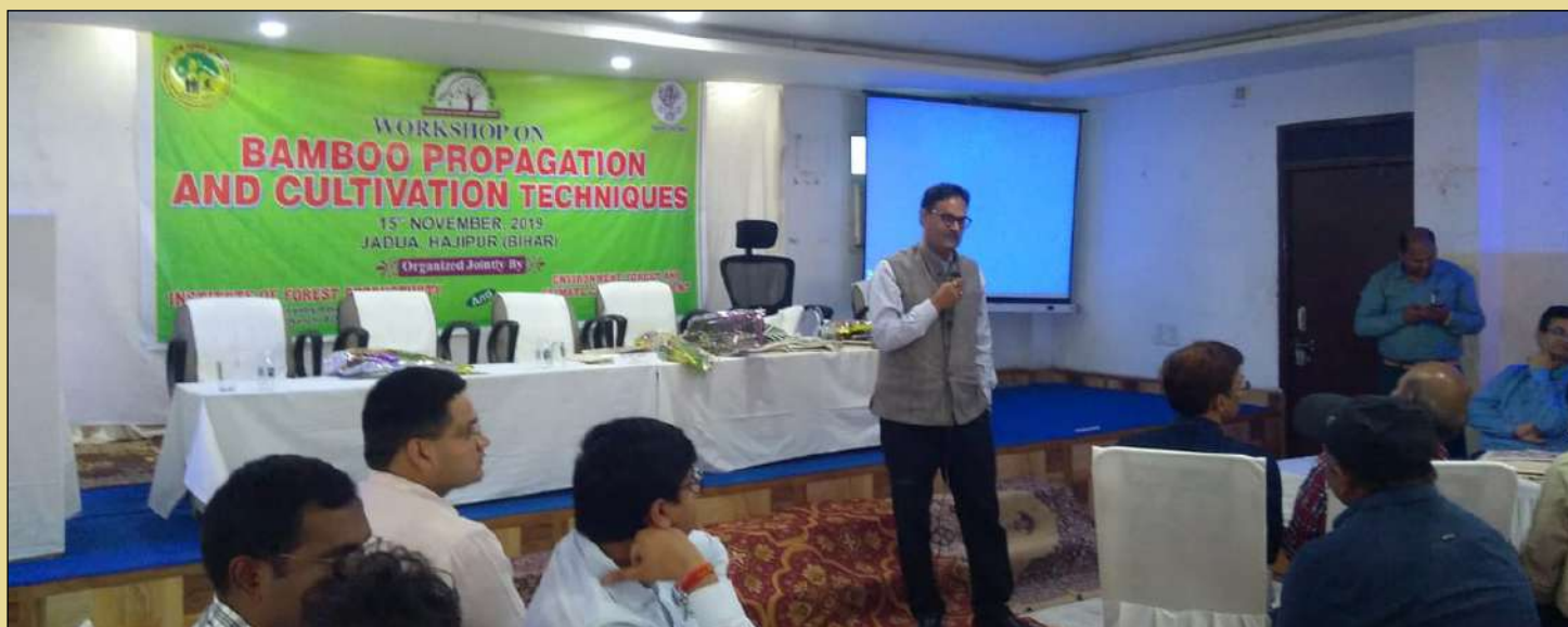
Workshop on Bamboo Propagation & Cultivation Technique