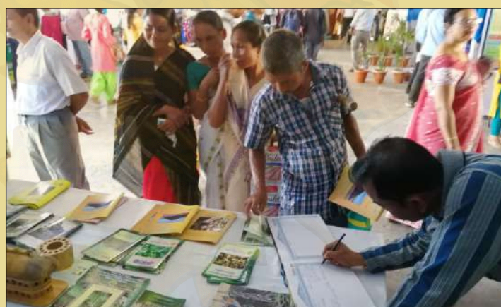
Farmers Fair at Regional Agricultural Research Station, Titabar