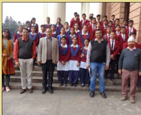
Students of JNV, Shankerpur, Sahaspur, Dehradun visited FRI