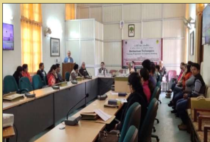
Training on Capacity Building in Herbarium Techniques