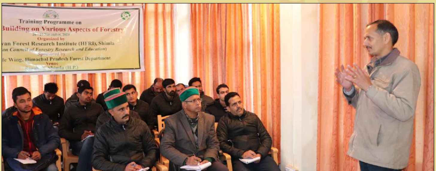
Training on Capacity Building on Various Aspects of Forestry