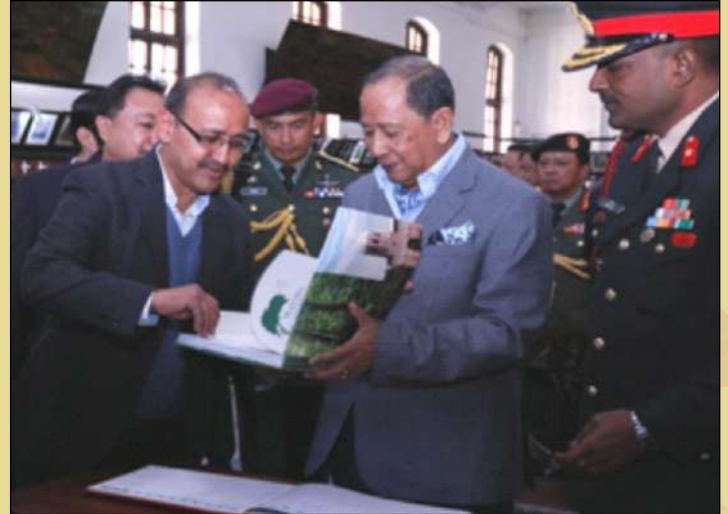
H.H. Sultan of Kedah, Malaysia visited FRI