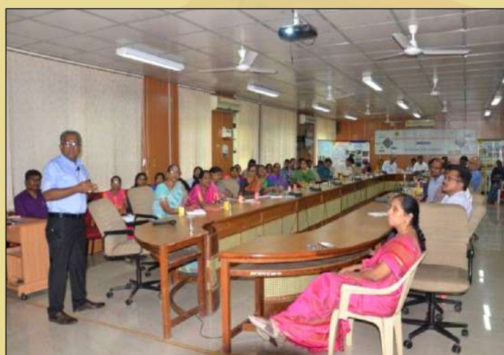
Workshop on Intellectual Property Rights – Prospects & Challenges for IFGTB