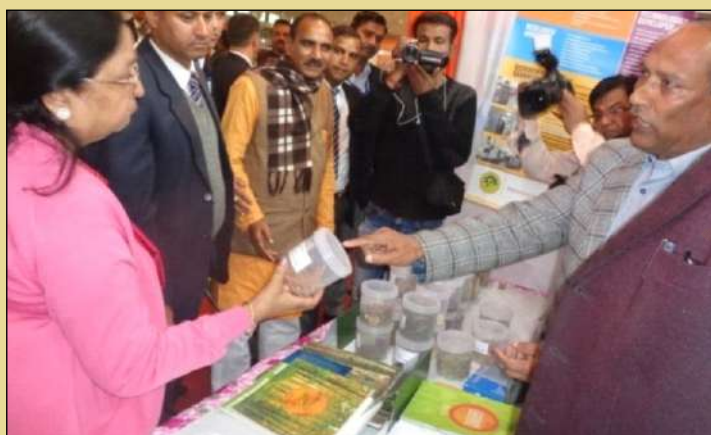
Exhibition at Swadeshi Jagran Evam Vikas Sansthan, Premnagar Ashram