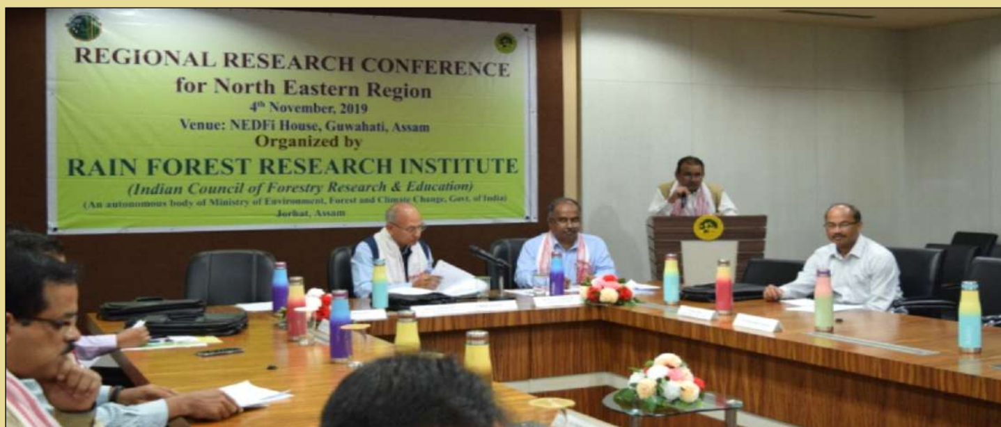
Regional Research Conference for the Northeastern region