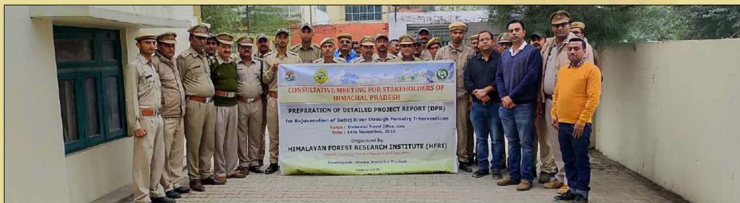
Consultative meeting for stakeholders of Himachal Pradesh