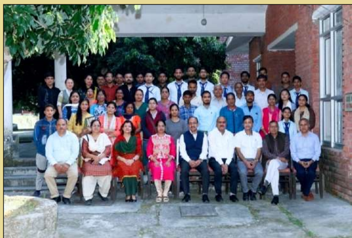
Participants of Silviculture & Forestry training