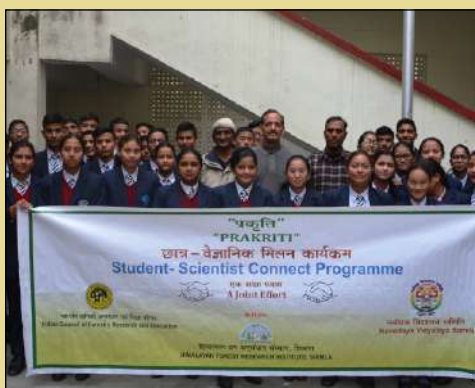
Students of JNV, Kullu, HP