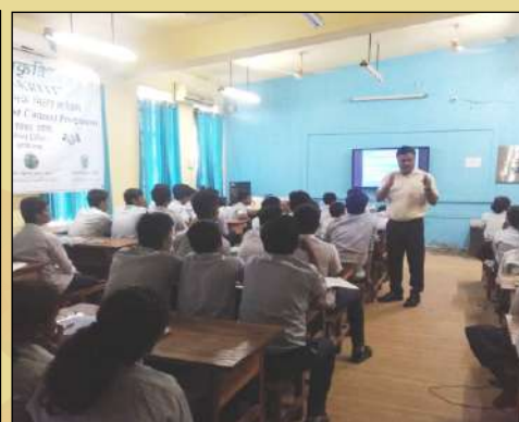
Students of JNV, Gomati, Tripura