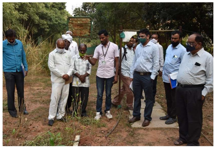
Field visit at IFB