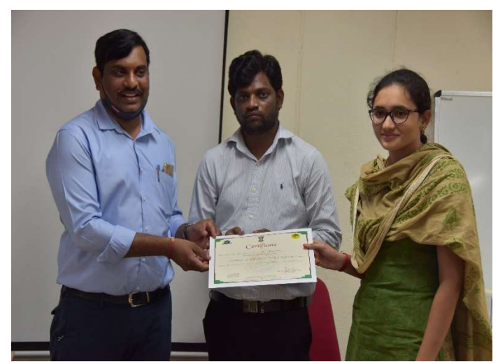
Distribution of Training certificates to participants at IFB