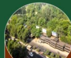
Green Urban Areas