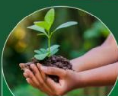
Protect Natural Areas