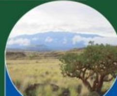
Restore Degraded Areas