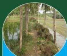
Sustainable Farming Practices