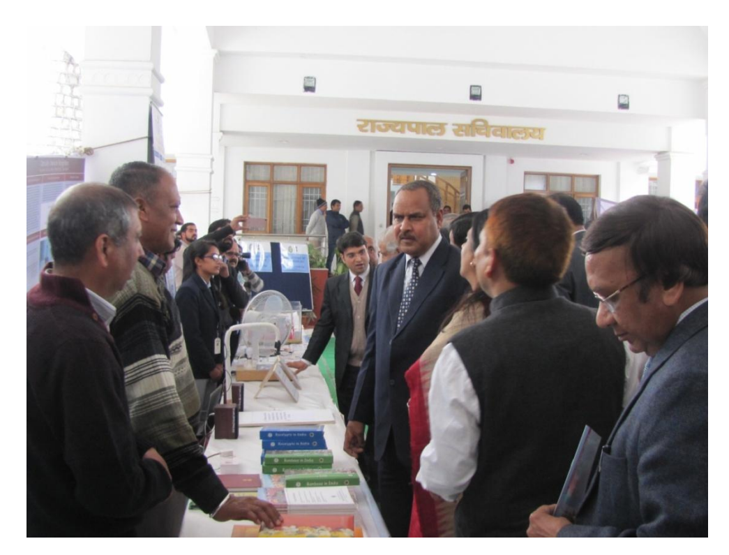
FRI Team interacting with visitors