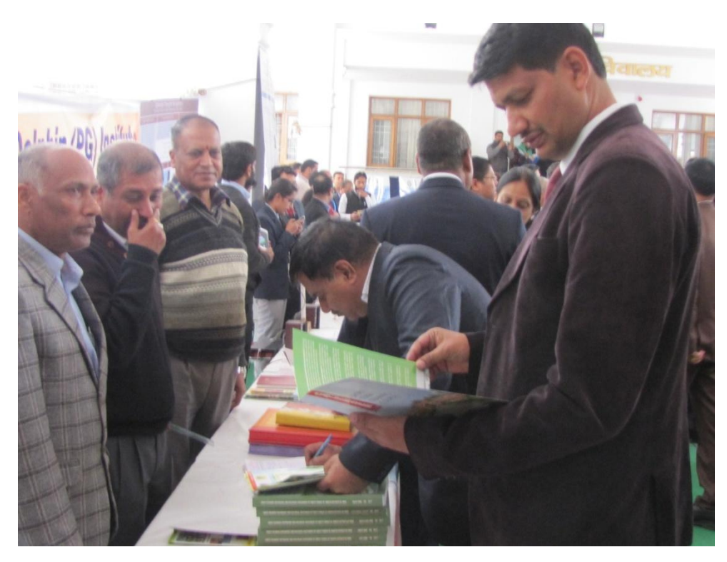
Visitors looking into Books and pamphlets