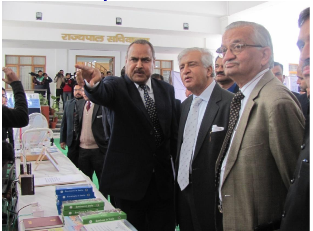
Hon'ble Governor Uttarakhand and other dignitaries in Exhibition