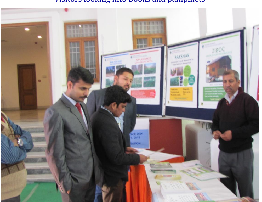
Visitors looking into Books and pamphlets