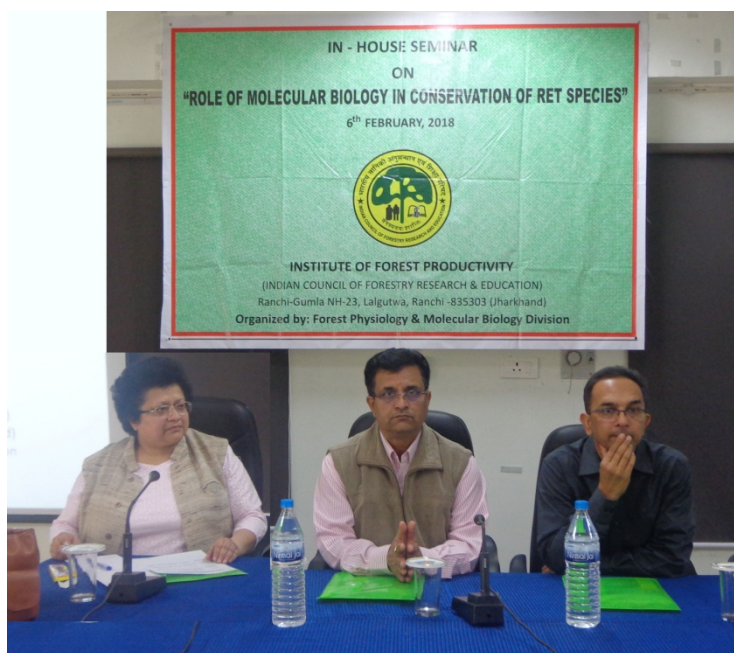
Start of the 5 th Institute level in-house seminar