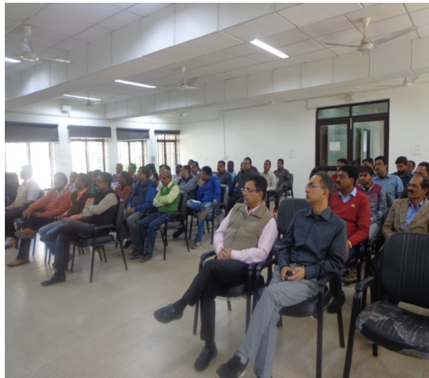
Scientists, Staff and students attending the seminar