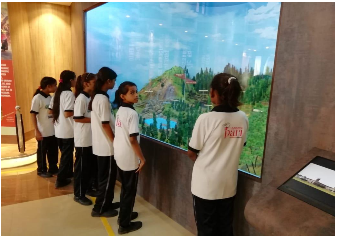
Students from Humana People to People, India, Project Shiksha Rawali Mehdood, Haridwar are in Silvicuture Museum, FRI