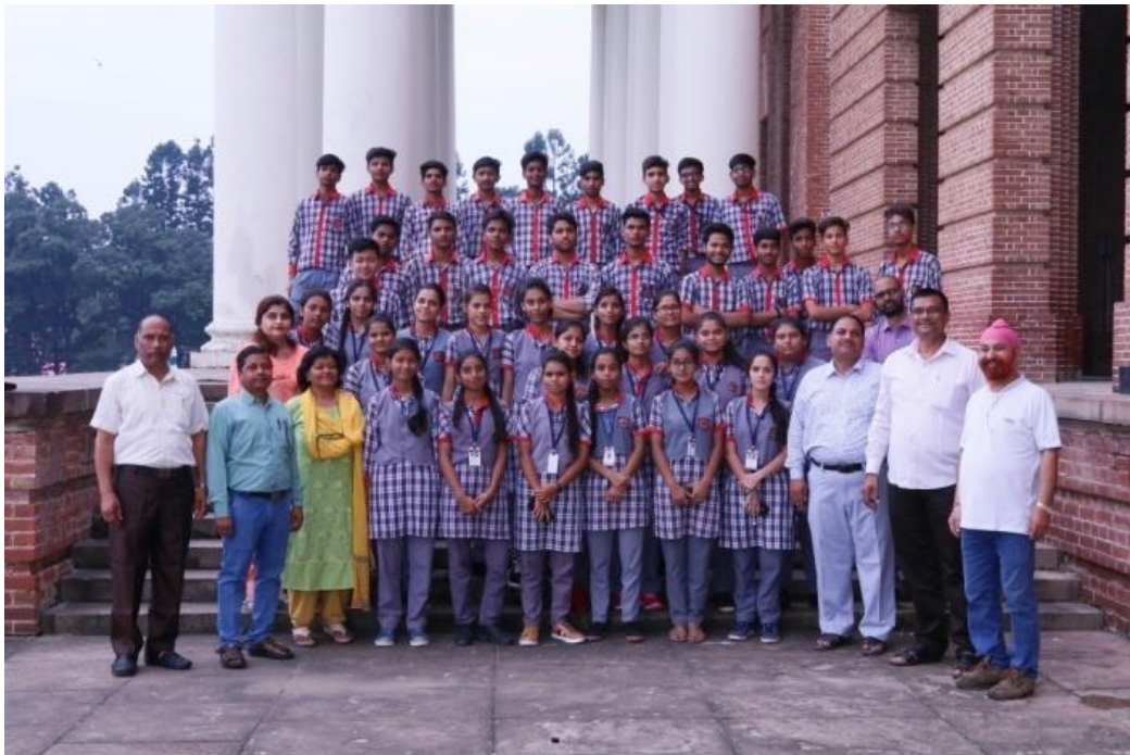
A group of 35 students of KV Khichripur visit on 22.08.2019