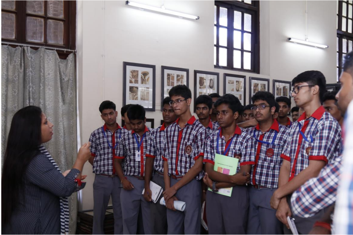
Interaction with students during museum visit