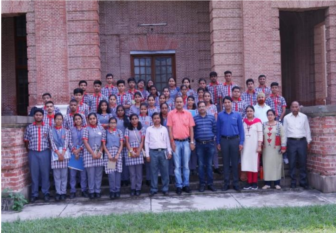
Visit a group of 44 students of KV No.2 APS colony Delhi Cantt. on 30.08.2019 from New Delhi