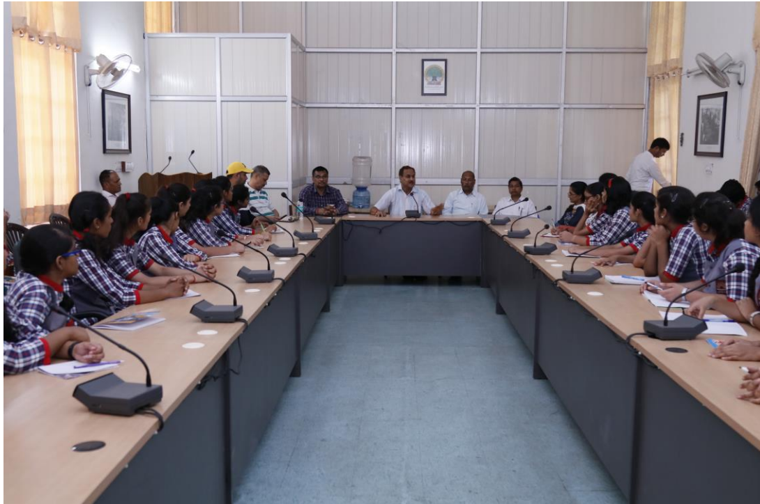
Visit a group of 44 students of KV Sainik Vihar on 26.08.2019