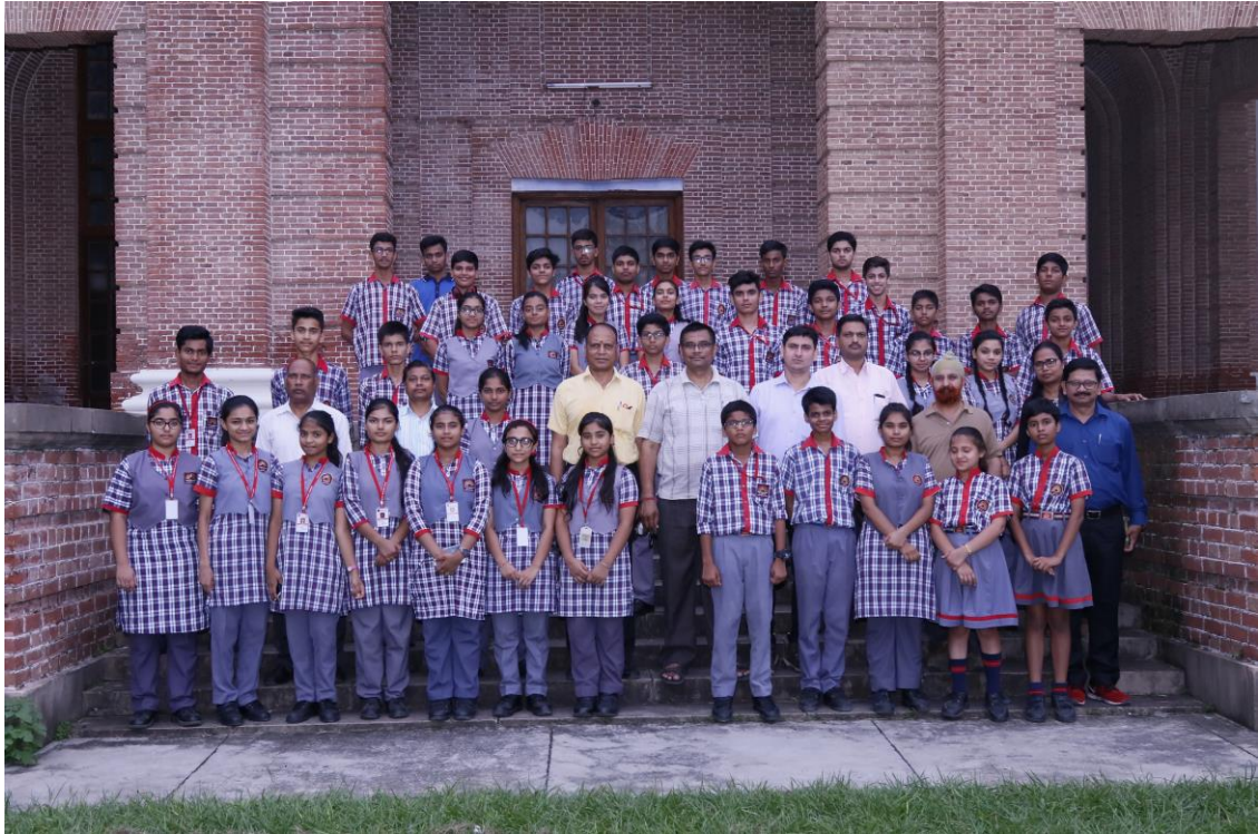
Visit a group of 44 students of KV Shalimar Bag on 29.08.2019