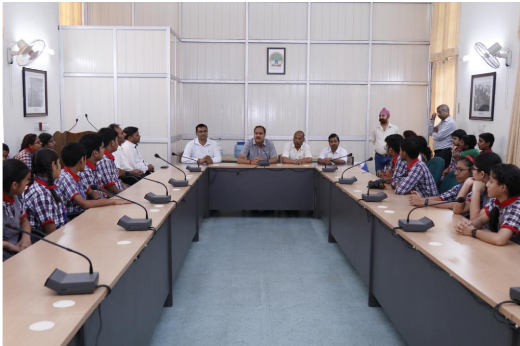
A group of 54 students of KV AGCR colony visit on 23.08.2019