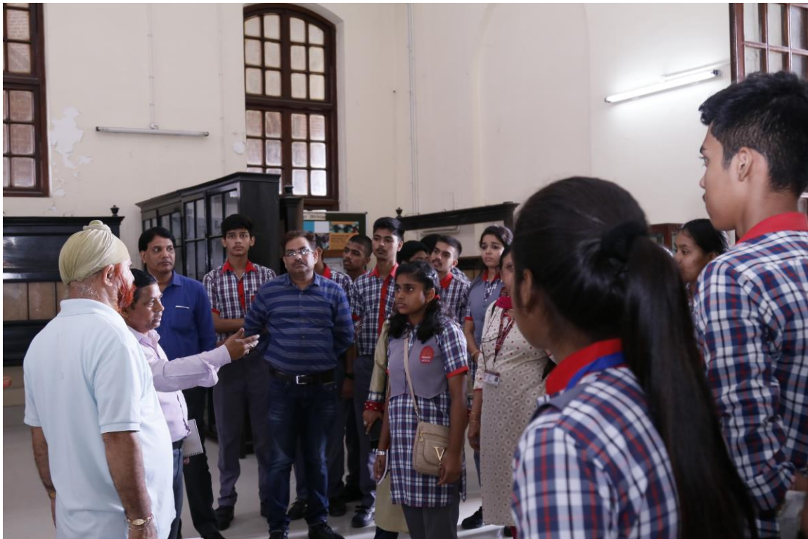
Connecting with students & teachers of KV APS colony Delhi Cantt during pathology museum visit