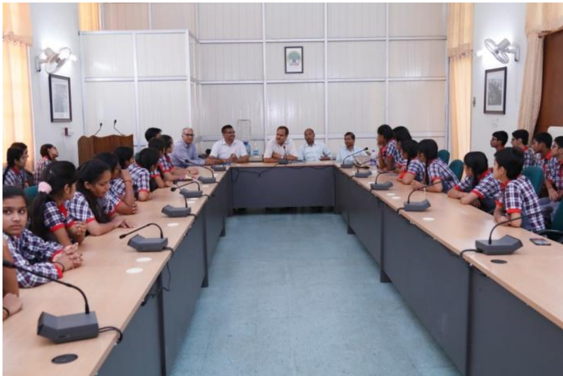
Interacting with a group of 54 students of KV NFC Vigyan Vihar on 28.08.2019