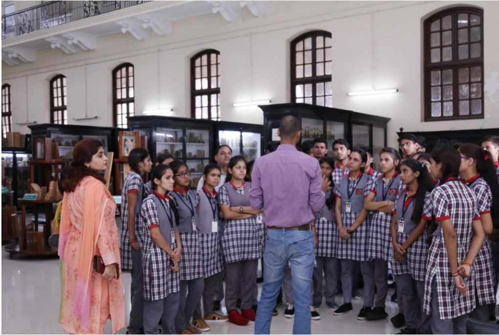
Interacting with students during pathology museum visit