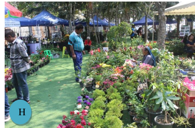
Figure 4: B-E: People visiting ICFRE-BRC stall; F-H: Various stalls at the Mela