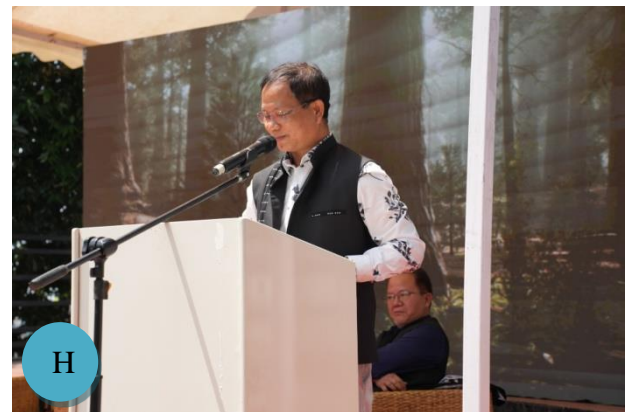
Figure 1: A-D: Welcoming & Felicitation of the Guests; E: Address by the Director; F-H: Address by the Guests