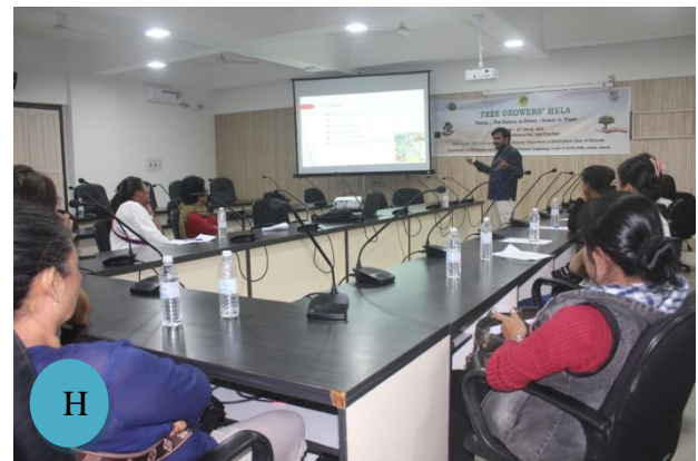
Figure 3: A-D: Visit of Dignitaries to ICFRE-BRC stall; E-H: Technical session