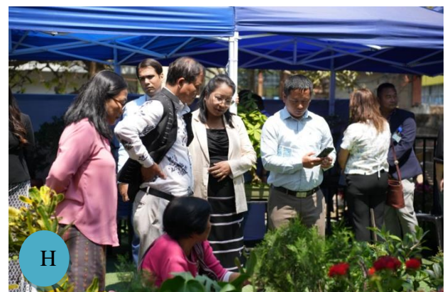
Figure 2: A-B: Releasing of Book; D: Inaguration of Mela; E-H: Visit to different stalls