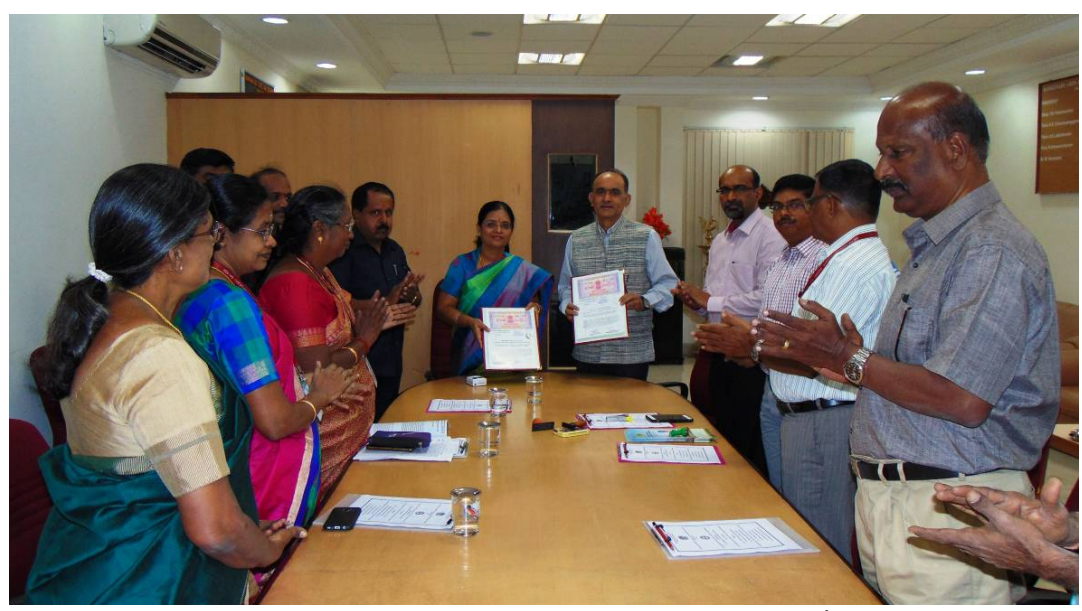
MoU signed between IFGTB and KASC, Coimbatore on 18th January, 2019

IFGTB may offer scientific expertise and guidance in the research projects of KASC as agreed upon on case to case basis by both the parties. IFGTB may undertake consultancy services, for KASC as per ICFRE guidelines in the area of bioprospecting, Biotechnology, biochemistry, and other scientific studies relates to forestry on the request of KASC and also to introduce innovative student intern programmes/trainings. The nodal officers of both the institutions will facilitate the activity as agreed upon on case to case basis by both the parties.