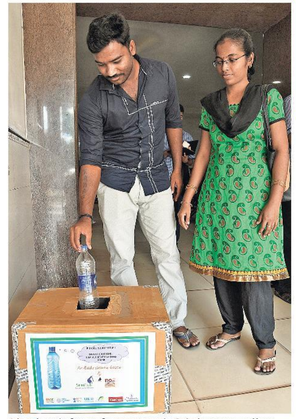
A box kept in front of a restaurant in Coimbatore to collect bottles.

Isha Foundation organised an awareness pro-