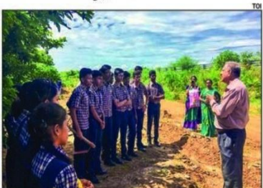
ALL EARS: School students get lessons in conservation of nature as part of the World Environment Day celebrations organised near Singanallur Lake on Tuesday

Among them, city-based NGO Siruthuli set up PET bottle collection centres at popular restaurants, hospi tals and halls, "Instead of dumping used plastic bottles in landfills, we decided to experiment by upcycling plas-tic. So we are requesting people to give used bottles to us.