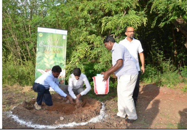
Avenue Tree Planting in Forest Campus