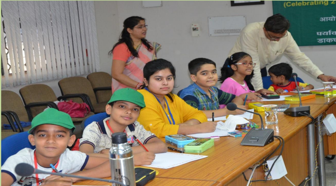
Conducting drawing completion to generate awareness about biodiversity among children