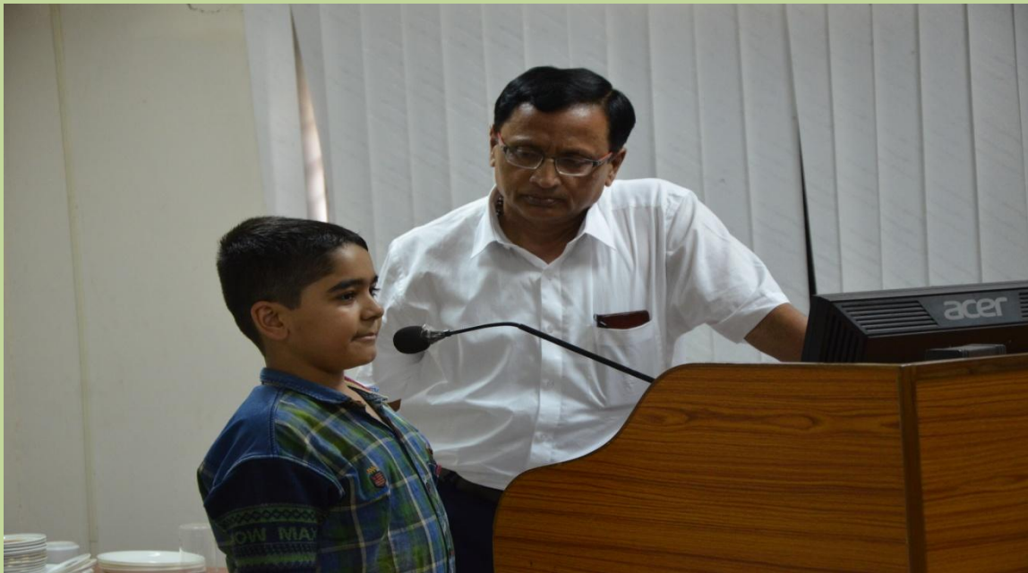
Views and experience sharing by participants on biodiversity and its conservation