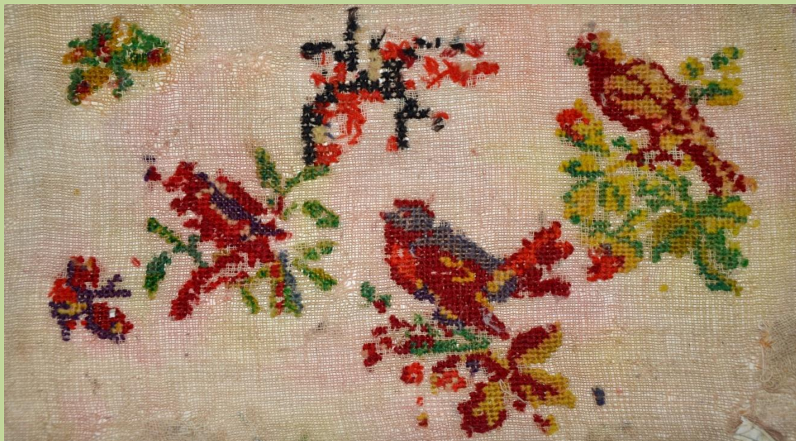
The displayed antique cross stitch “My Garden (1899)” by artist Late Ms. Ushabati Devi reflecting peoples love for association of plants, animals and nature