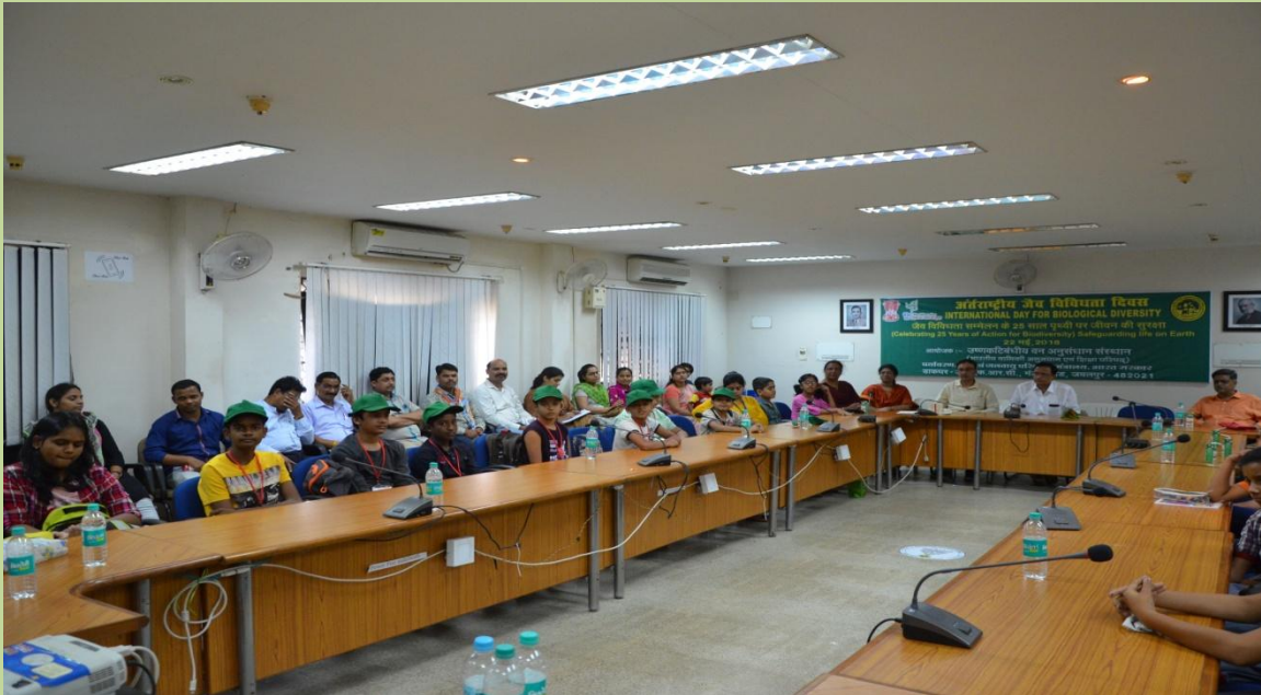
Celebration of Biodiversity Day at Tropical Forest Research Institute, Jabalpur