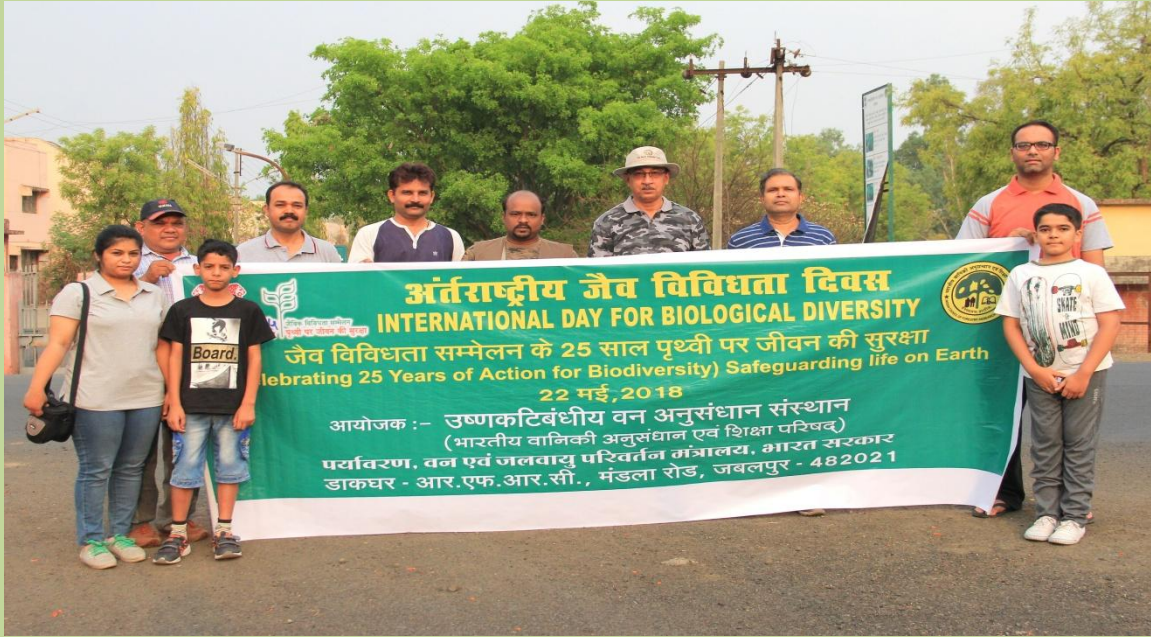
Exploring The Green trail for witnessing biodiversity of TFRI Campus