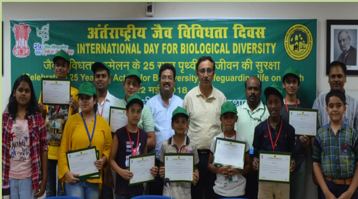
Group of participants of Biodiversity day