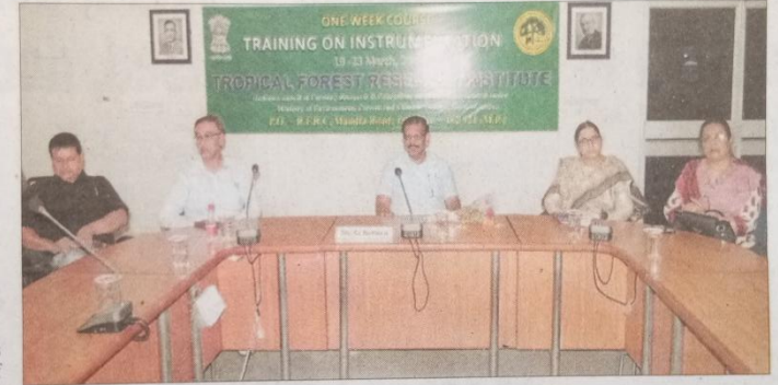
Senior officers during inaugural session of training on instrumentation at TFRI.

Addressing the programme, Director highlighted that rapid advancements in the field of science require a thorough understanding of underlying principles and essential know how of instruments, techniques and principles behind it. Instrumentation techniques keep advancing with advancement in both science and technology. In order to continue to engage in quality research, it is necessary to keep one-self abreast on the modern techniques as they evolve