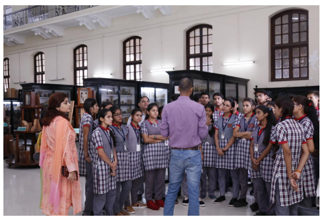
Interacting with students during pathology museum visit