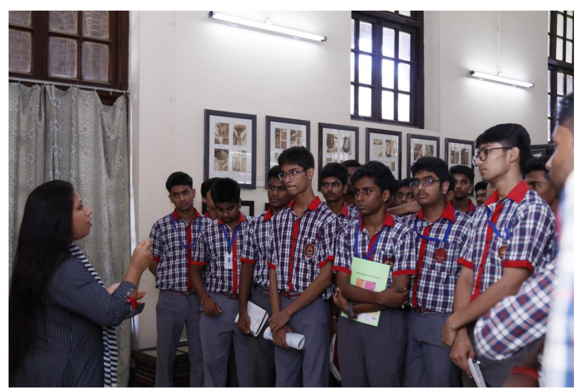
Interaction with students during museum visit