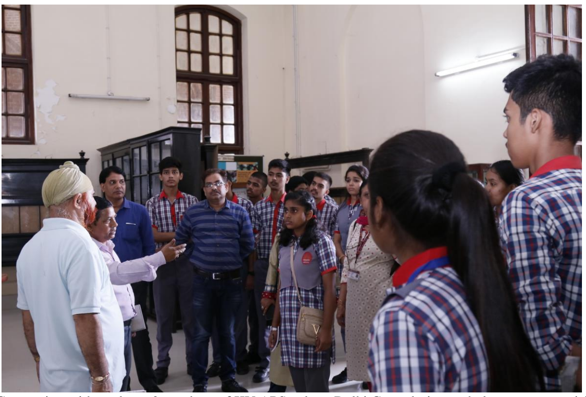
Connecting with students & teachers of KV APS colony Delhi Cantt during pathology museum visit