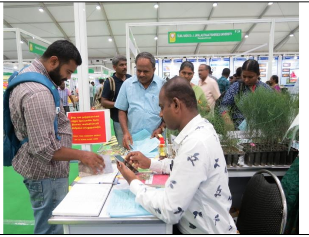
Participants in discussion and registering IFGTB-ENVIS Mobile App