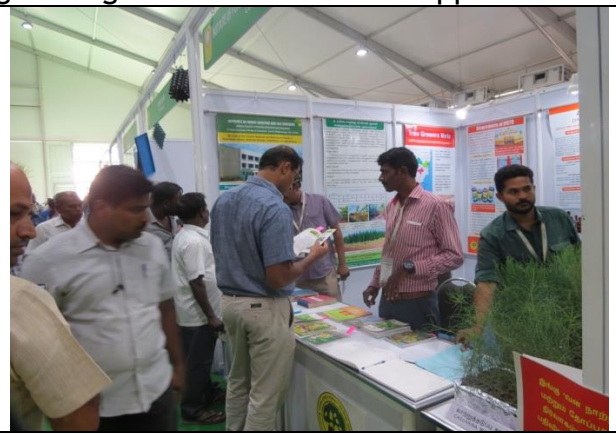
Visitors observing products and publications of IFGTB