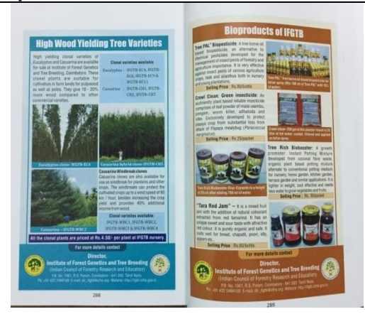
Advertisement released by IFGTB in the FAIR Directory