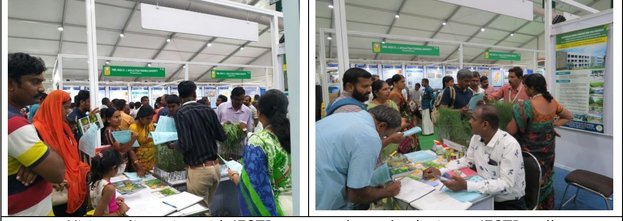
Visitors discussing with IFGTB team on the technologies at IFGTB stall