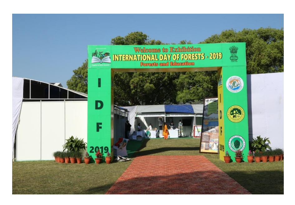
Exhibition organized during IDF- 2019