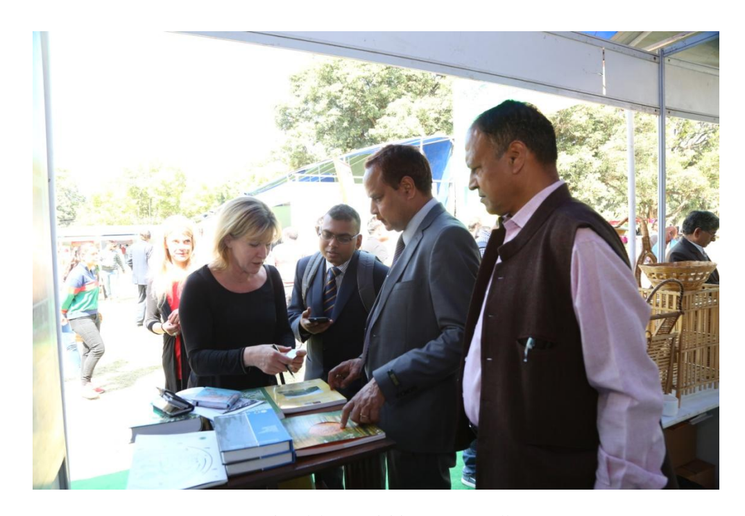
Foreign delegate visiting at FRI stall