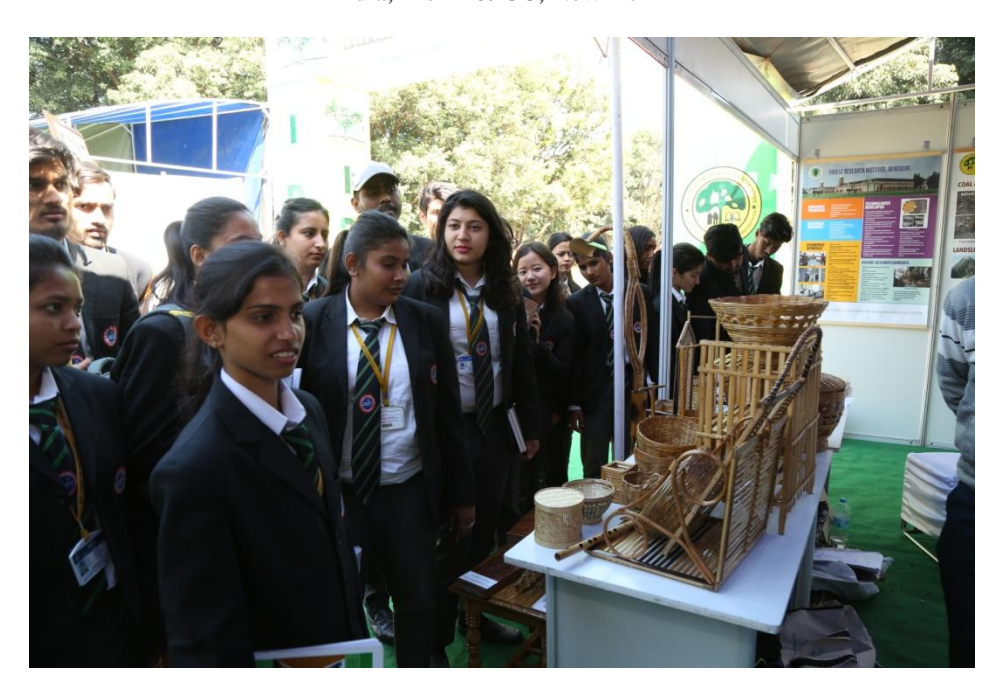
Students at FRI stall