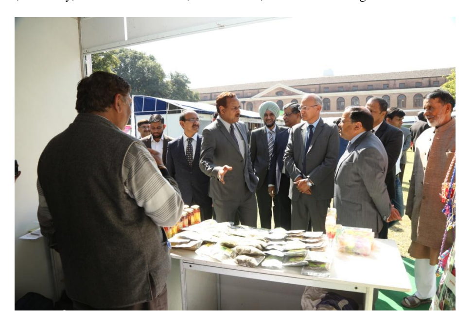
Secretary, Govt of India visiting a stall established by NGO