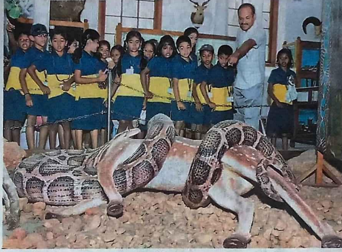
■ சர்வதேச வன நாளை முன்னிட்டு, கோவை வனக் கல்லூரியில் உள்ள காஸ் அருங்காட்சியகத்தில் பள்ளி மாணவ மாணவிகள் இலவசமாக பார்வையிட்டனர்.

வனஅருங்காட்சியகத்தில் இலவசமாக பார்வையிடலாம்