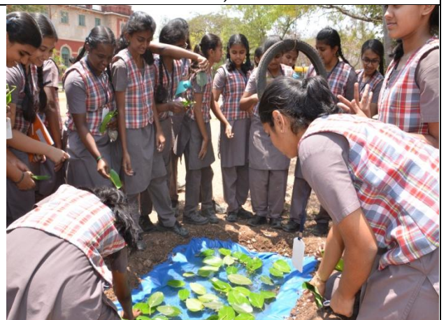
Activity on Artificial Pond Making for Birds