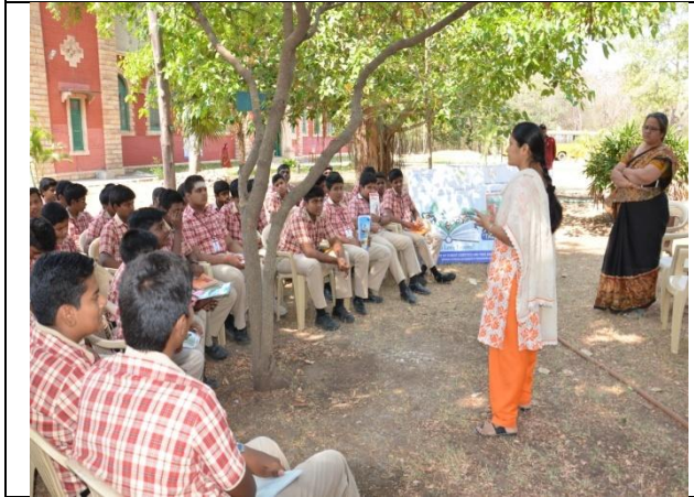
Lecture on Forest & Wildlife