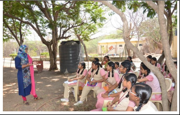
Lecture on Know about DNA