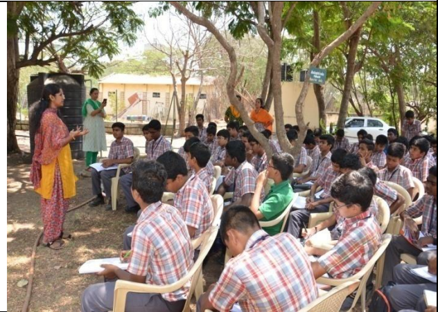
Lecture on Global warming & Climate Change