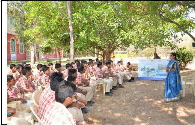
Lecture on Nature and Forest Conservation