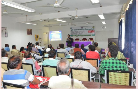
Trainees listening about agri-horti medel suitable for Chhindwara district.