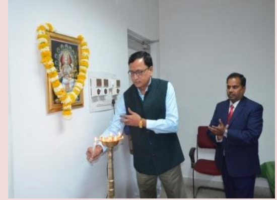
Lighting of lamp during inaugural session