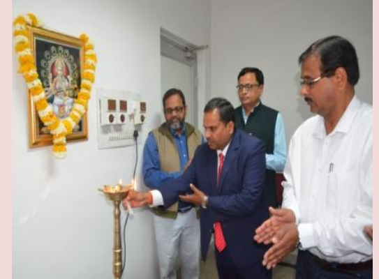
Dignitaries inaugurated the event