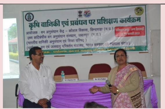
Discussion during the presentation