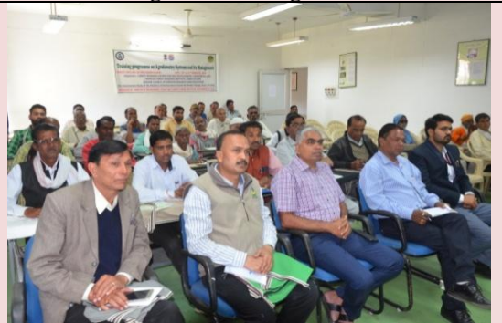
Overview of technical session