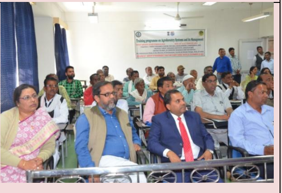
Dignitaries during the technical session