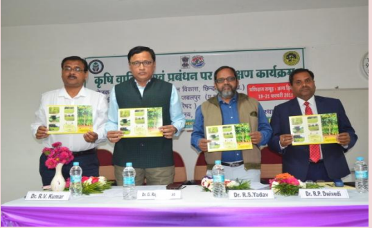
Relase of brouchure on Agroforestry and its management during the event