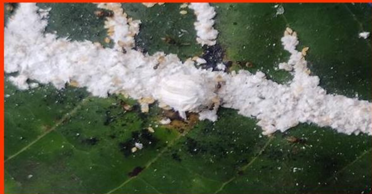
Mango Mealy Bug

The mango fruit fly which are mainly 3 species ( Bactrocera dorsalis , B. correctus & B. Zonatus ) among which the Bactrocera dorsalis is quite prominent. And it is polyphagous and attacks all types of fruit crops. But on mango this pest is mainly considered as the pest of quarantine importance, as the many of the consignments, export consignments of the mango will get rejected due to the infestation by this pest. In fact the adult fly will insert the egg into the mango fruits at the developing stage. And the maggots which are white in colour they enter and then feed on the mango pulp. So as a result