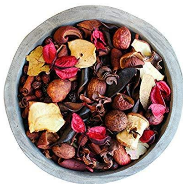
Fig 13: Pot pourri

Pot pourri is a mixture of dried, sweet-scented plant parts which includes flowers, leaves, seeds, stems and roots. Naturally scented plants used in traditional potpourri include rose flowers, hips or oils, rosemary leaves and flowers, orange peels, lemon peel, mint leaves and flowers, jasmine flower and oil, fennel seed, cloves, cedar wood shavings, jujube flowers and blooms, lavender flowers and leaves, cinnamon bark and cassia bark.