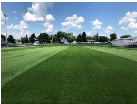
Fig 5: Turf

specific grasses for the stadia to be constructed for the event.