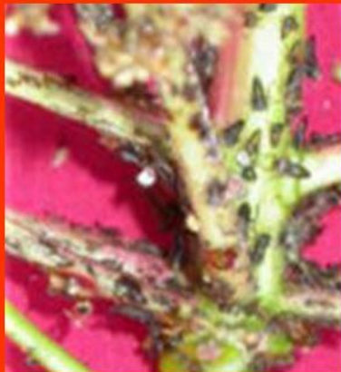
Mango Leaf Hopper

leaves. But most important is mainly on the fruits. So we can see the stalks which have been infested by the mango mealy bug. And which leads to the drying up of the fruits and as well as the dropping of fruits. This also causes the sooty mould development and which affects the photosynthetic activity.