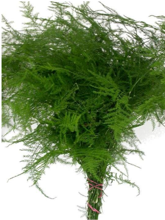
Fig 3: Cut greens