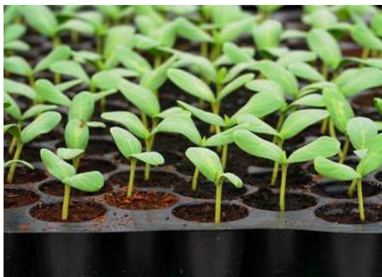
Fig 10: Plug plant production