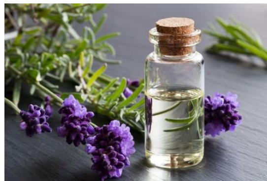
Fig 6: Essential oil

Essential oils are one of the most valuable products that are being used mankind since ages. Essential oils are highly concentrated substances extracted from various parts of aromatic plants and trees. It is derived from the word essence that refers to the distinct scent of the plant. It is life-blood of the plant, protecting it from bacterial and viral infections. The use of essential oils for therapeutic, spiritual, hygienic and ritualistic purposes goes back to a number of ancient civilizations including the Chinese, Indians, Egyptians, Greeks, and Romans who used them in cosmetics, perfumes and drugs. India has rich biodiversity in many essential oil plant species. But, it is mainly concentrated on rose and jasmine for essential oil extraction. The major flower crops important for essential oil extraction include rose, jasmine, tuberose, vanilla etc. Brazil, China, USA, Egypt, India, Mexico, Guatemala and Indonesia are the major producers of essential oils. The major consumers are the USA (40%), Western Europe (30%) and Japan (7%).