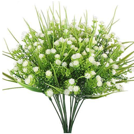
Fig 12: Fillers used in bouquet