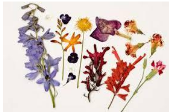
Fig 4: Dry flowers

Spain are leading importers country. In India flower export has increased after liberalized EXIM policy. The contribution of dried ornamentals in total export is about 71% at present. The main exporting material from India includes lotus pods, dried flowers of camellia, dahlia, marigold, wood rose, wild lilies, paper flower and naturally dried plant parts from Himalayan region.