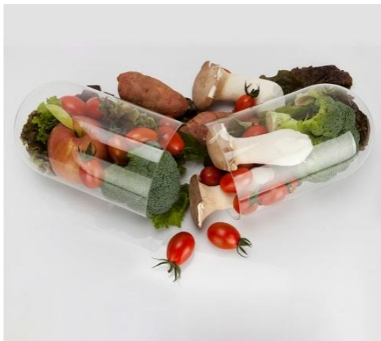
Fig 9: Nutraceuticals

nutraceuticals is a highly desirable objective to improve the health of the people of the country, especially that of the poor people. Now, the nutraceuticals related research for improving its quality and quantity is an important area for ongoing biotechnological investigations.