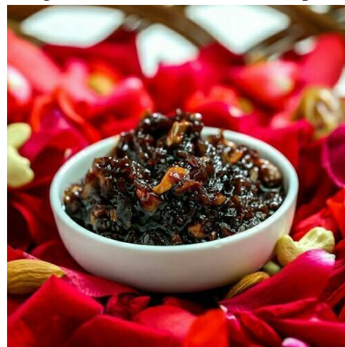
Fig 14: Gulkand

Preserving rose petals in sugar is known as Gulkand. It is prepared by mixing rose petals and sugar in the ratio of 1:1. Gulkand is an ayurvedic tonic. Its benefit includes reduction in eye inflammation and redness, strengthening of the teeth and gums, and the treatment of acidity. Gulkand has cooling properties, thus it is beneficial in alleviating all heat related problems like tiredness, lethargy, itching, aches and pains. It also helps in reducing burning sensations in the soles and palms.