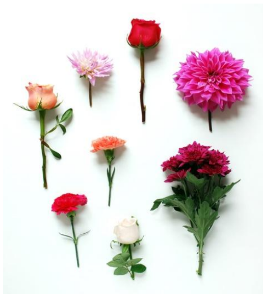
Fig 1: Cut flowers

double flower varieties are equally popular. Tuberosa flowers are also sold loose in some areas for preparing garlands and wreaths. The other main cut flowers include Asters, Gerbera, Carnation, Anthodium, Liliun, and Orchid. Production of Orchids is restricted mainly in the north-eastern hill regions, besides parts of the southern states of Kerala and Karnataka.