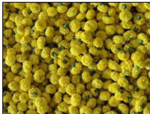
Fig 2: Marigold as loose flowers

wholesalers, retailers and the consumers. A small portion of loose flowers is being exported to Middle East, UK and USA for the expatriate Indians.