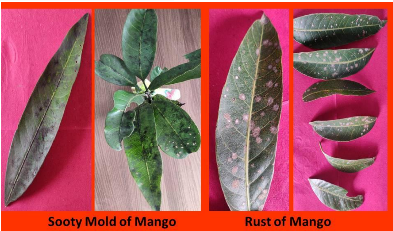
Sooty Mold of Mango

The disease causes infection on leaves thus leads to the reduction in photosynthetic activity and defoliation of leaves and thereby reducing the vitality of the host plant. The disease is marked by the presence of the rusty red spots mainly on leaves and sometimes on petioles and bark of young twigs. . These spots are greenish grey in colour and velvety in texture which later turn into reddish brown. The circular and slightly elevated spots sometimes coalesce to form larger and irregular spots. The fungus also causes infection on stem and the affected portion of stem cracks. In case of severe infection, the bark becomes thick, twigs get enlarged but remain stunted and the foliage finally dries up. Two to three sprays of Copper Oxychloride (0.3%) should be used for controlling the disease.