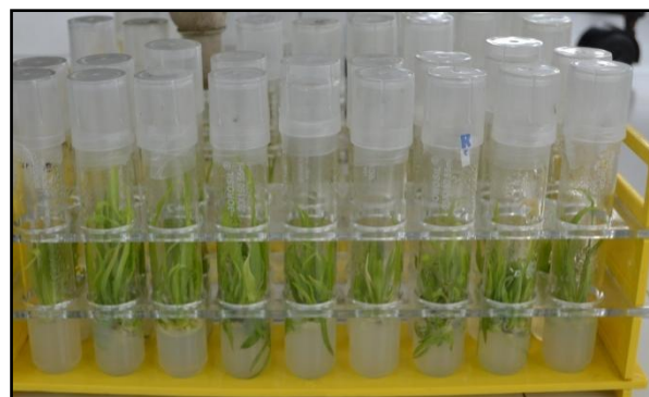
Fig 11: Tissue cultured plants

Plant tissue culture has a great impact on both agriculture and industry, through providing plants needed to meet the ever increasing world demand. It has made significant contributions to the advancement of agricultural sciences in recent times and today they constitute an indispensable tool in modern agriculture. Commercial tissue culture was born in India in 1987 when A.V. Thomas and Company Kerala (AVT) established their first production unit in Cochin for clonal propagation of superior genotypes of selected cardamom plants. Plant tissue culture activities in India are at present confined to production of ornamental and flowering plants, which have a large global export market. Demand for flowers is increasing globally. India is expected to emerge as a strong player in the consumer market of biotechnology products in the coming years. In India there are more than 90 tissue culture units producing mostly foliage and flowering potted plants. Our tissue culture laboratories can produce wide range of bulbs in micro propagation way and that can be bulked in the fields of cold climate areas like Kashmir in economical way. Also there is good possibility to export mini bulbs to European countries.