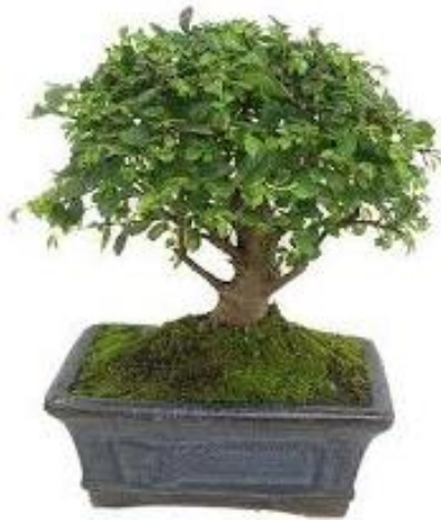
Fig 7: Bonsai

Specialty flowers: Specialty flowers are the cut flowers, which are not widely known and also grown in small pockets but have high prospects in the international market. These are a high value crops and are cut flower species other than major cut flowers. Heliconia, Red Ginger, Bird of