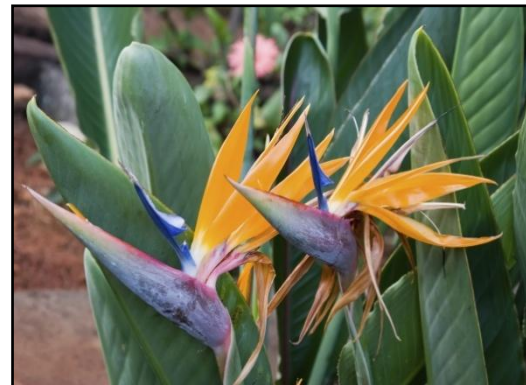
Fig 8: Heliconia and Bird of Paradise as Speciality flowers